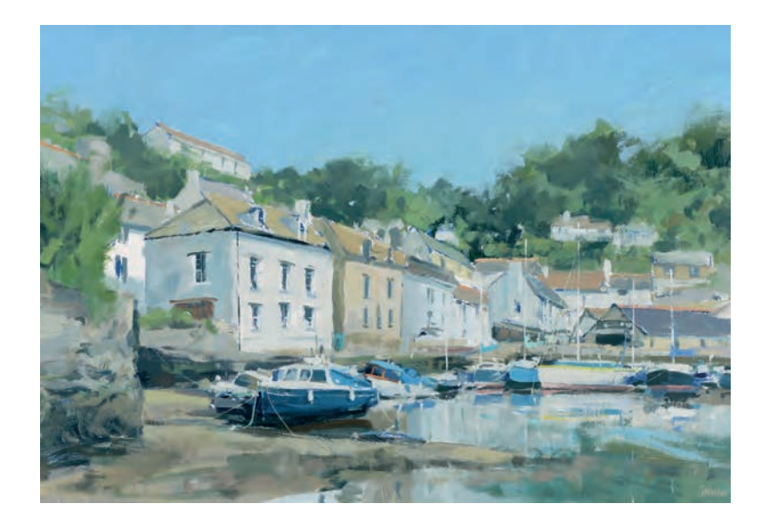
Polperro Oil on panel 18 x 26 inches