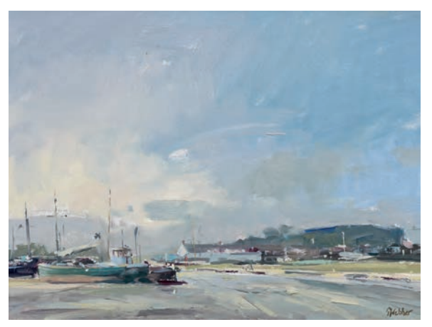
Pin Mill Oil on panel 12 x16 inches