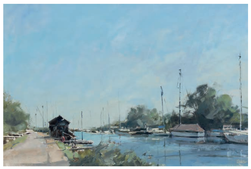
Chelmer and Blackwater Oil on panel 16 x 24 inches