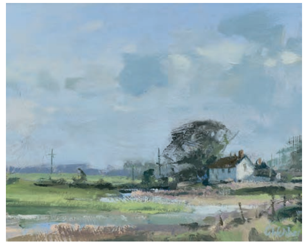
Cottage on the River Blyth Oil on panel 8 x 10 inches