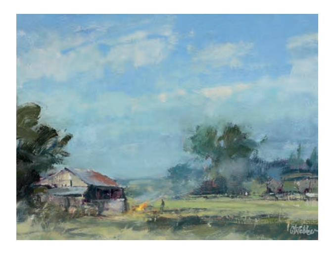
Anticipating Homer Oil on panel 9 x 12 inches