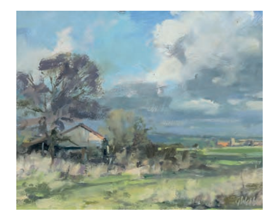
Sheltered Barn Oil on panel 8 x10 inches