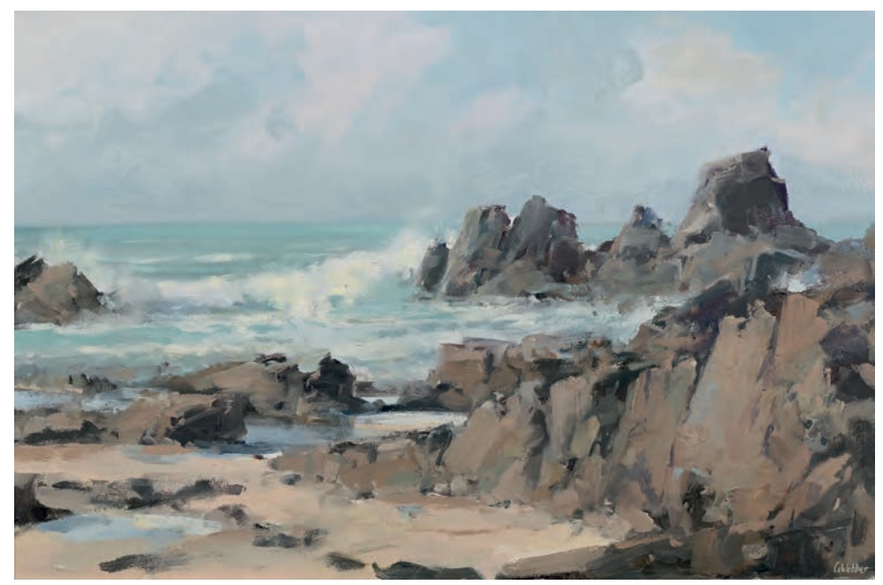
Rocks at Crooklets Oil on panel 20 x 30 inches