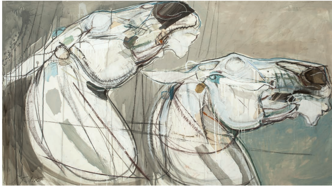
Phantom Heads Mixed media on paper 33 x 59 inches