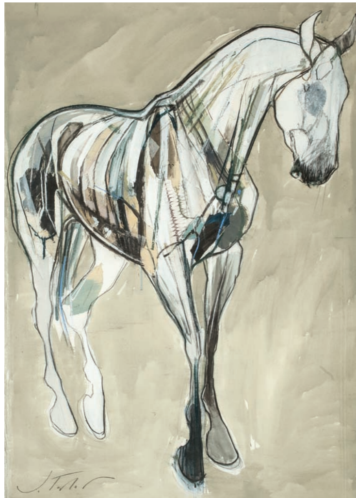
Phantom Mixed media on paper 43 x 32 inches