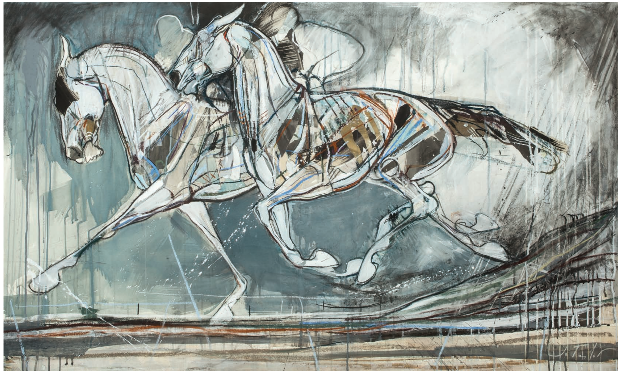
Irish Boys III- The Ferocious Brothers Mixed media on paper 33 x 59 inches