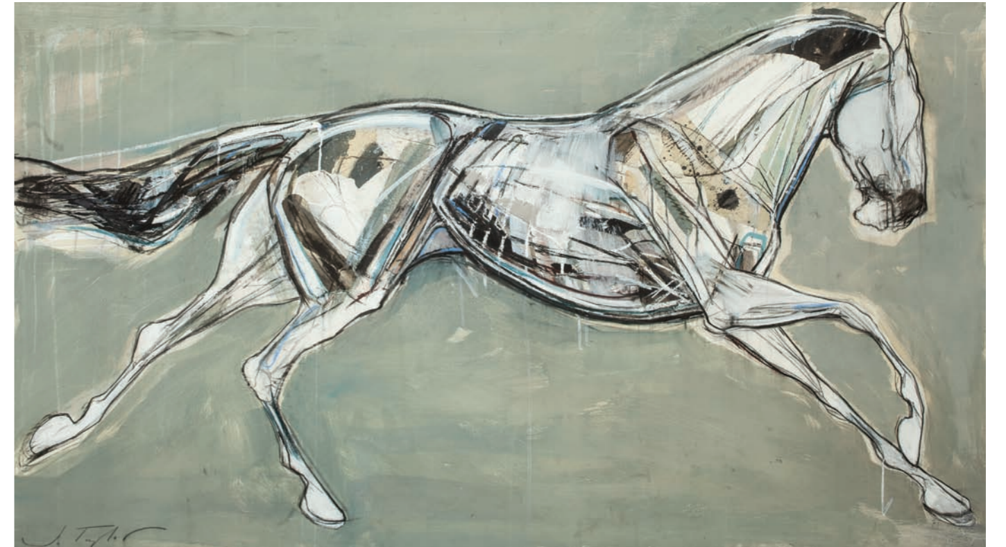
Regulus Mixed media on paper 34 x 59 inches