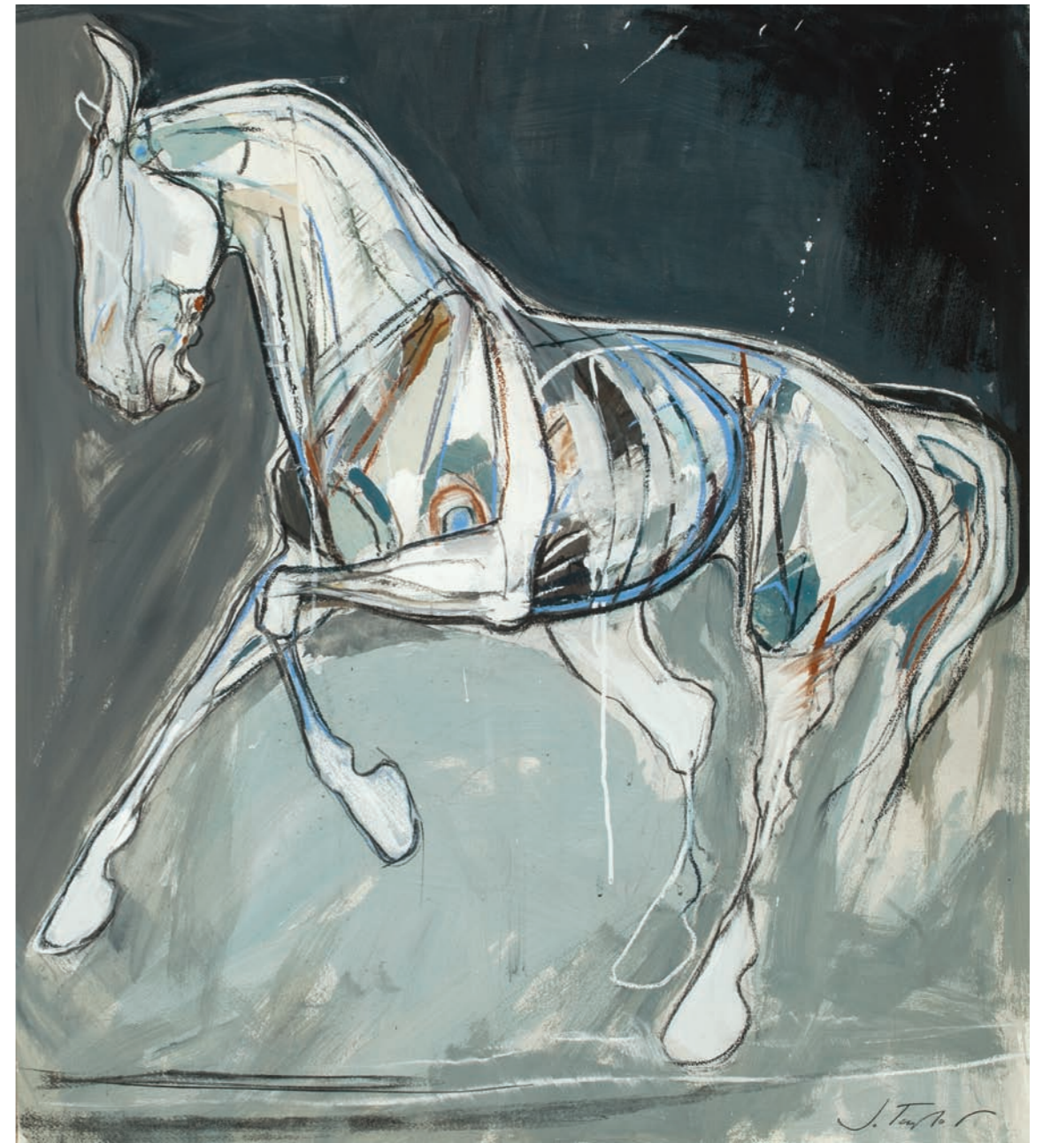
Johnny and the Stars Mixed media on paper 33 x 40 inches