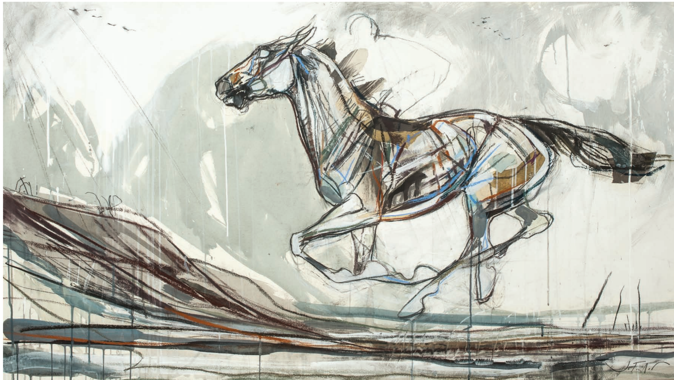
Irish Boys II - The Wanderer mixed media on paper 33 x 59 inches