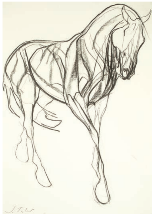
The Proposition (Study) Charcoal 33 x 22 inches