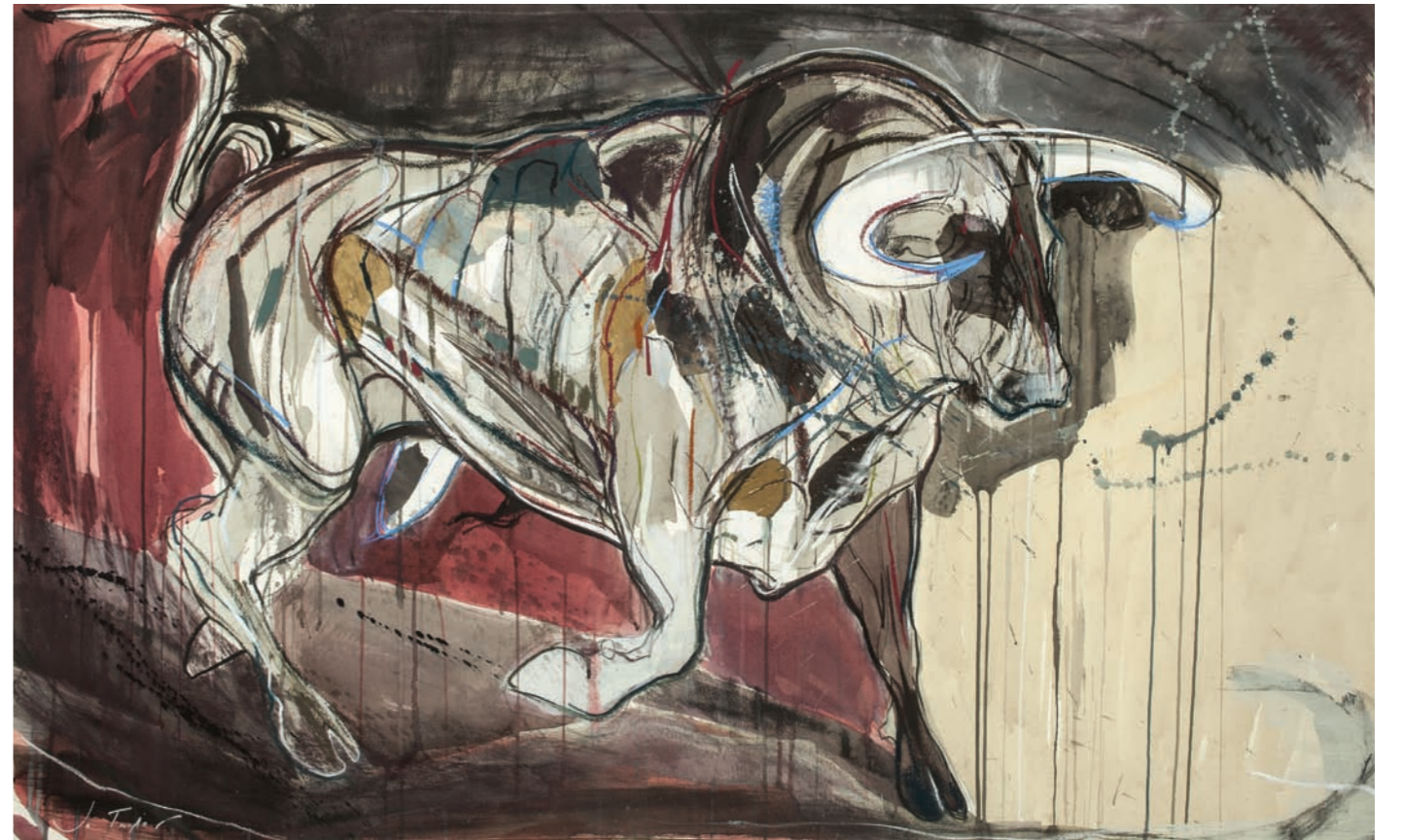
The Silent Assassin Mixed media on paper 34 x 60 inches