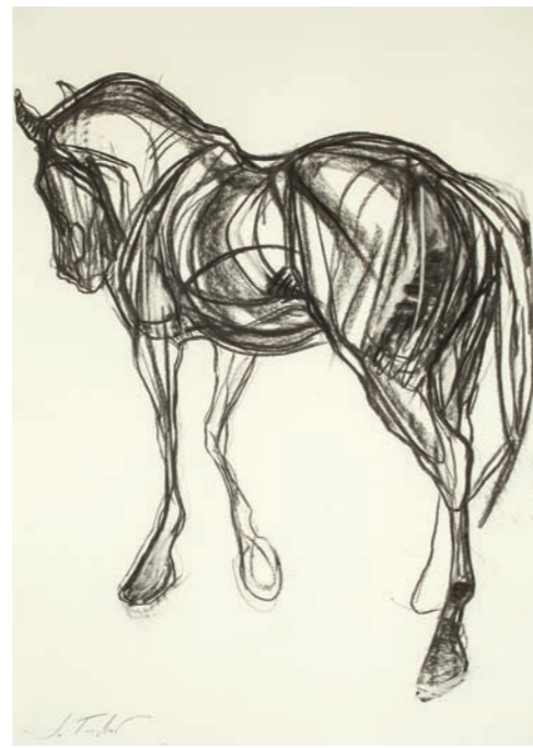
Shiny Beast II Charcoal 33 x 22 inches