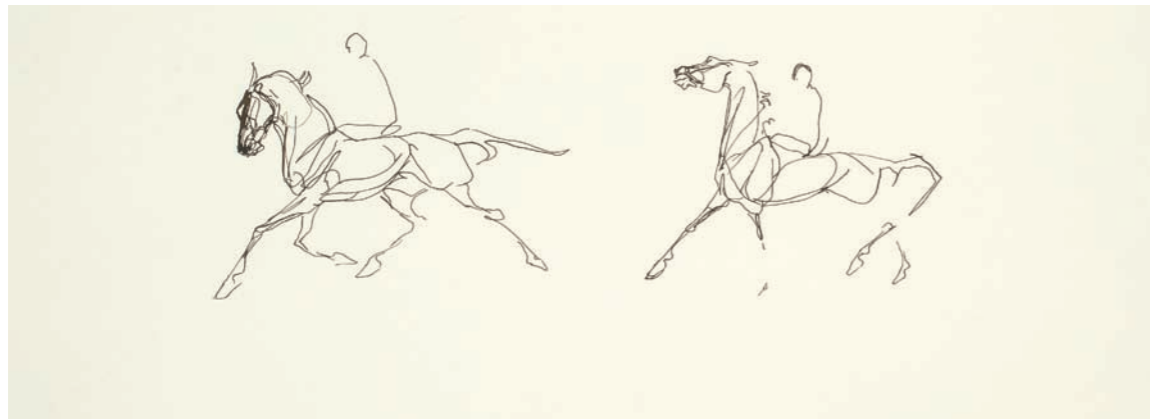
Sea Horses Ink 8 x 16 inches