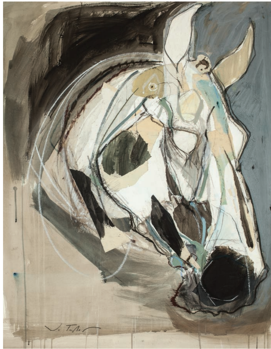
Hercules Mixed media on paper 41 x 33 inches