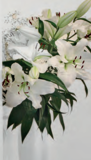
Light Geometry Oil on canvas 48 x 60 inches