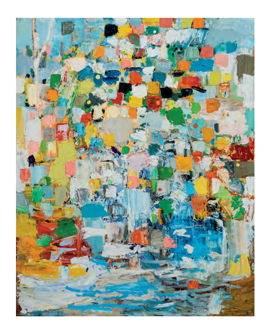
Primer of Colours Oil on canvas 60 x 48 inches

Celestial Coronation Oil on canvas 48 x 60 inches (right)