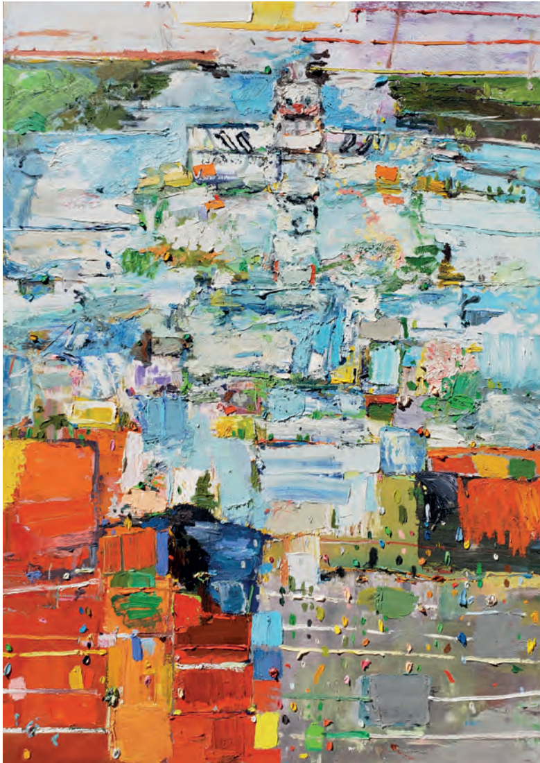
The Indian Church Oil on canvas 70 x 50 inches