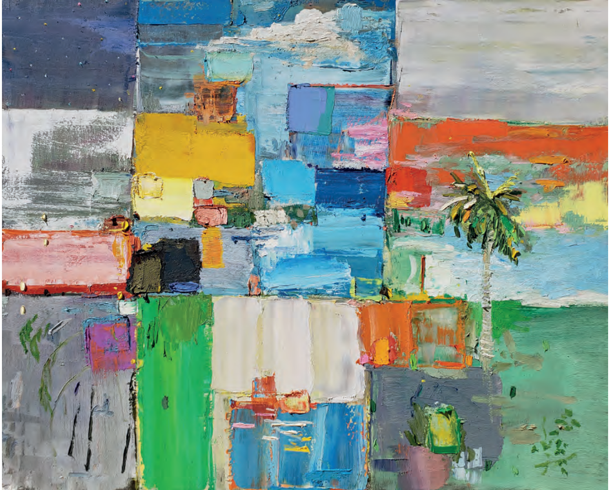
Rum Factory Oil on canvas 48 x 60 inches