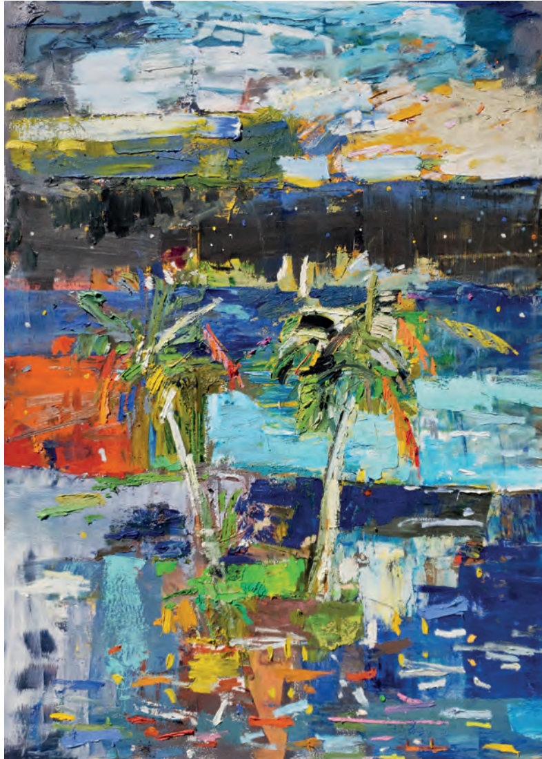
The Crossed Palms Oil on canvas 74 x 54 inches