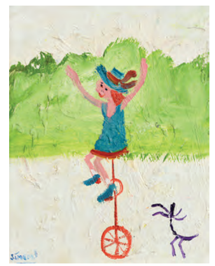
Your Turn Next Fido Oil on panel 9 x 7 inches