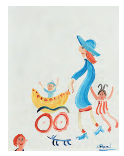
Sunday Afternoon Oil on panel 9 x 7 inches