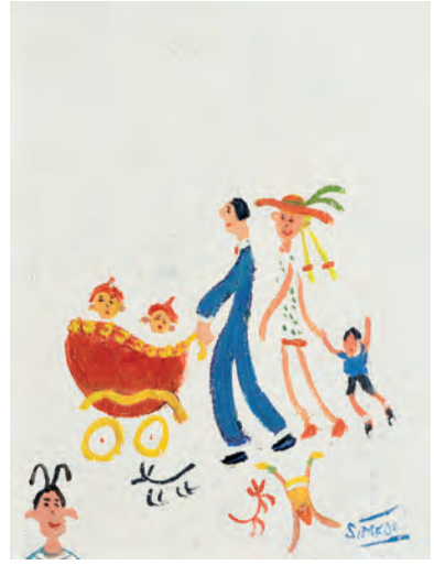
Sunday Best Oil on panel 9 x 7 inches