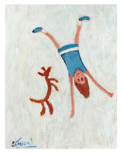
Aunt Dot and Trixie Oil on panel 9 x 7 inches