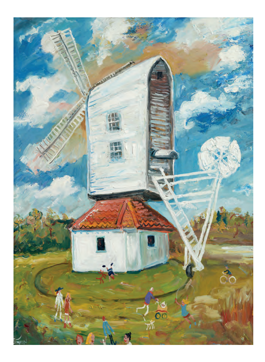
The Windmill, Thorpeness Oil on panell 23 x 17 inches