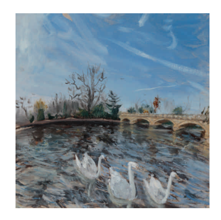
Serpentine Swans Oil on board 20 x 20 inches