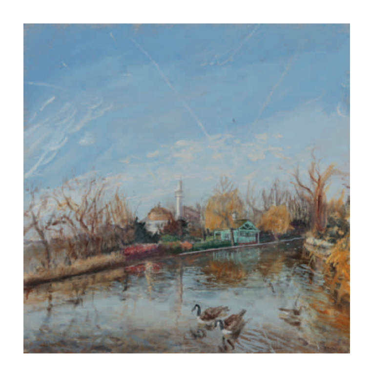
Regent's Park Boating Lake Oil on board 20 x 20 inches