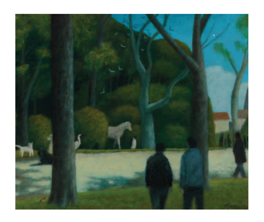
Wood at the Edge of Town, Day Oil on board 12 x 14 inches Reading Oil on board 30 x 22 inches (left)