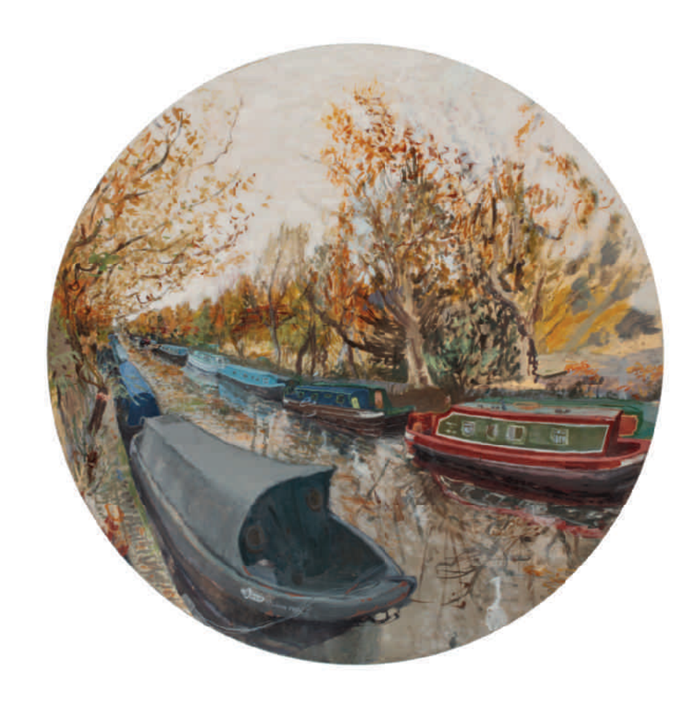
Little Venice Autumn Oil on board 38 x 38 inches