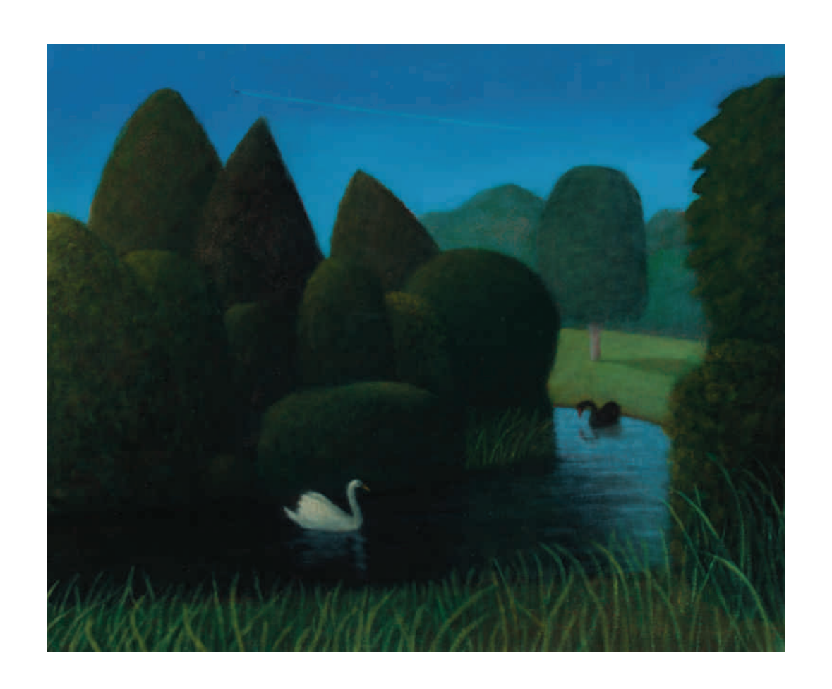
Echo and Narcissus Oil on board 20 x 24 inches