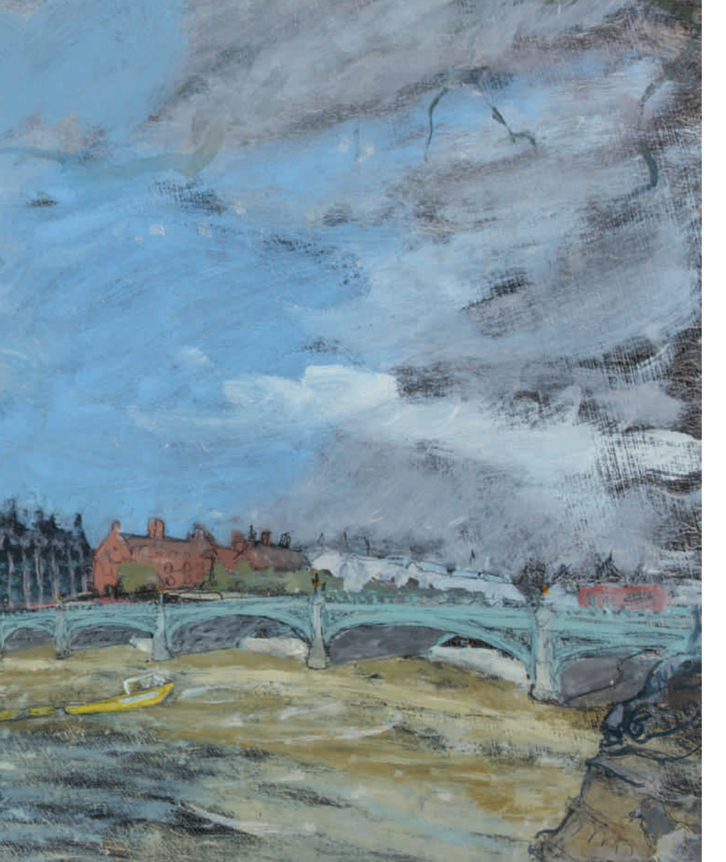
Palace of Westminster Oil on board 14 x 32 inches