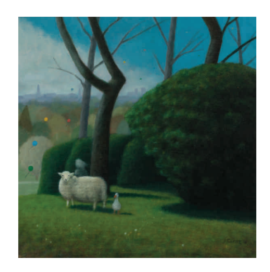
Sanctuary Hill Oil on board 20 x 20 inches