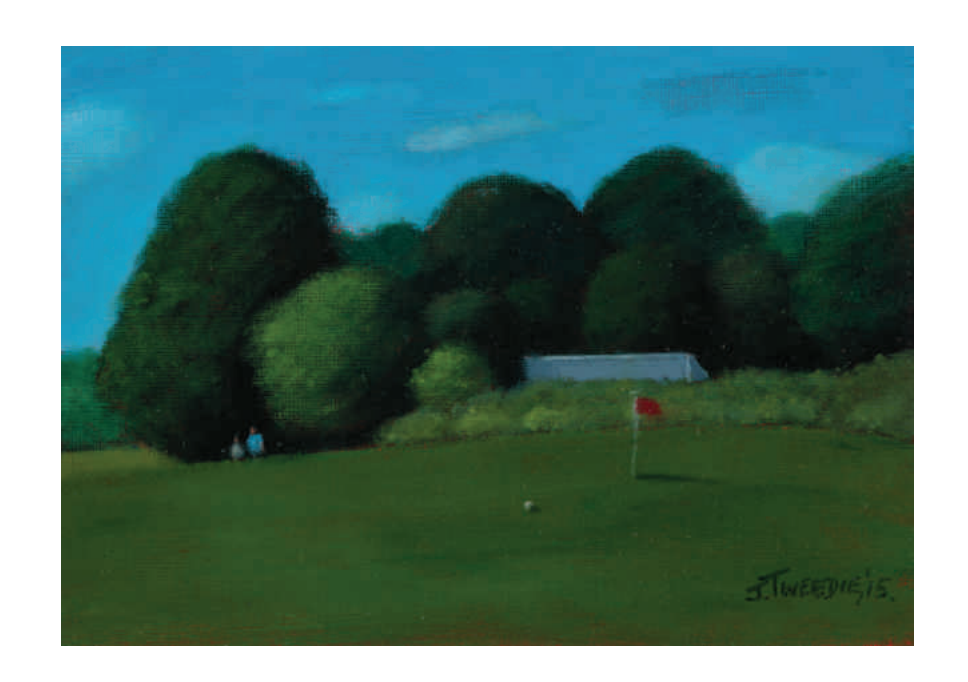
Queens Park Study Oil on board 6 x 8 inches