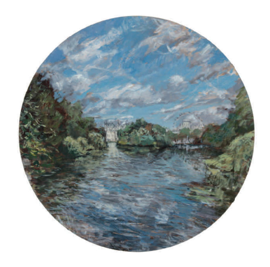
St. James's Lake Oil on board 20 x 20 inches