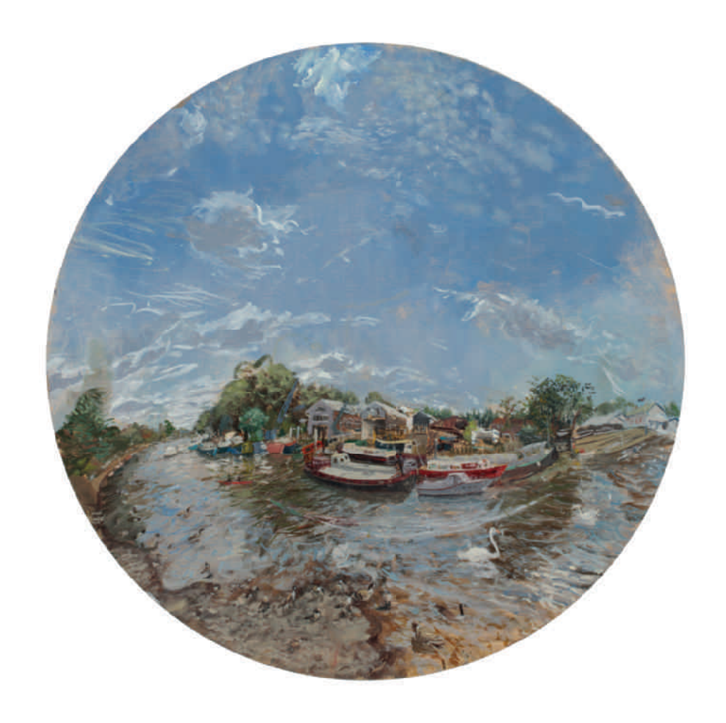
Eel Pie Island Oil on board 45 x 45 inches