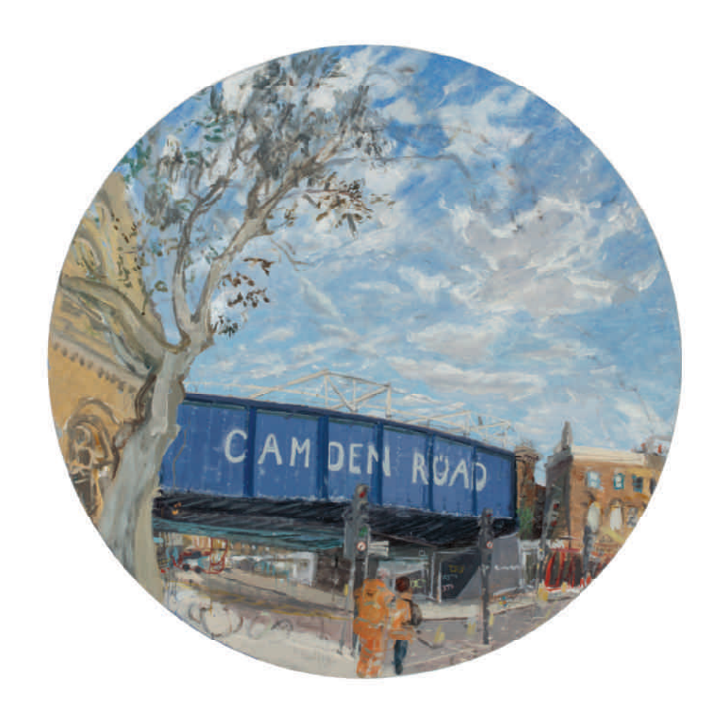
Camden Road Clouds Oil on board 38 x 38 inches