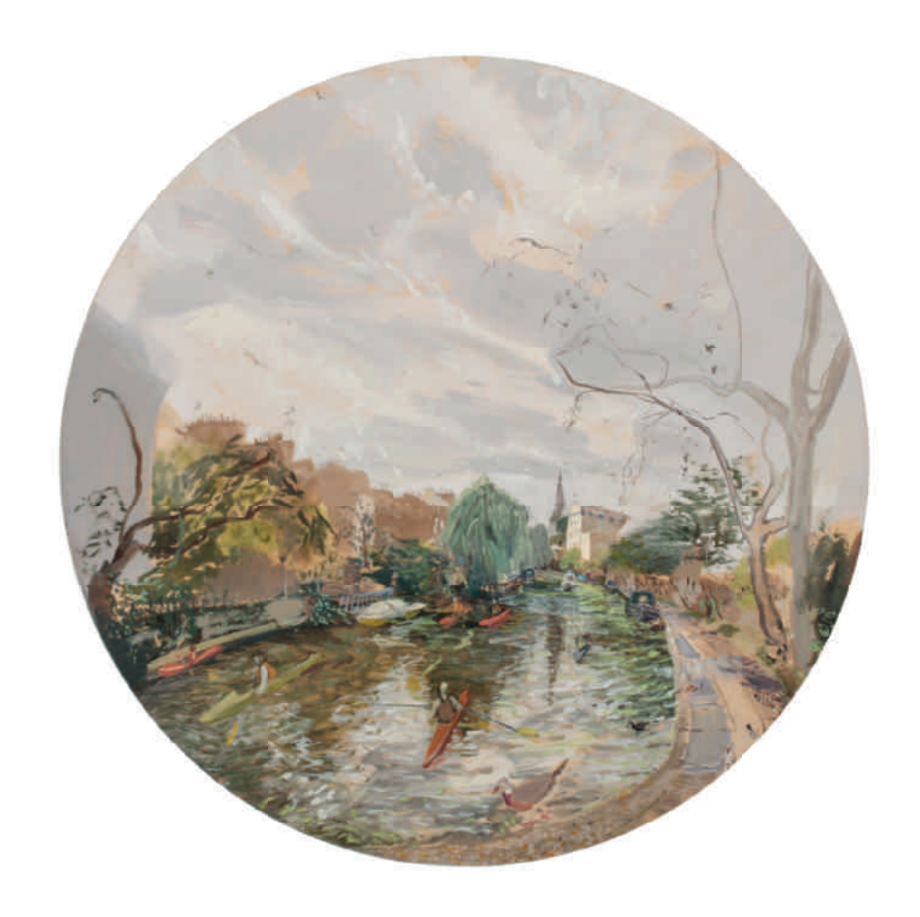
Regent's Canal Canoe Oil on board 38 x 38 inches