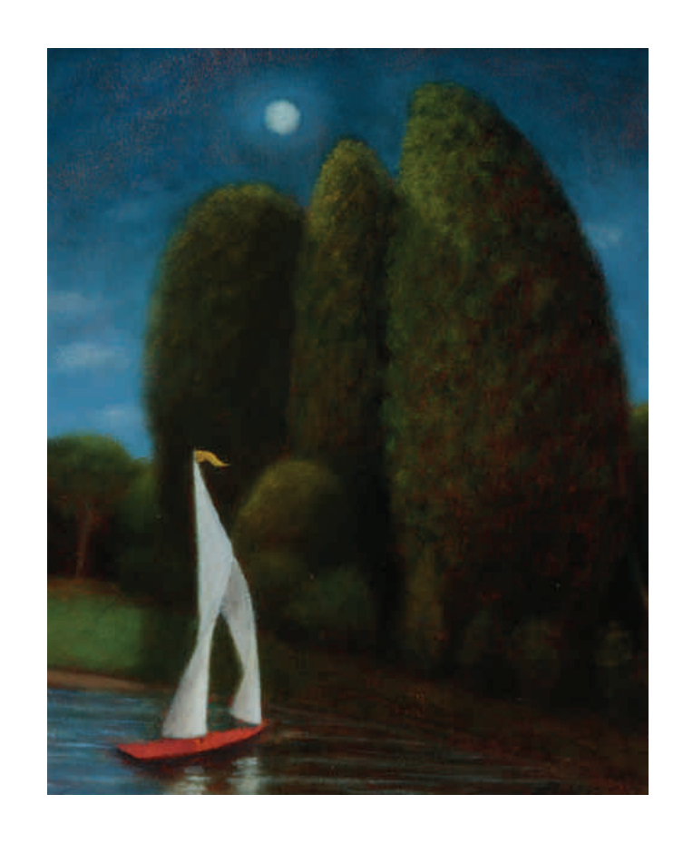
Mysterious Return Oil on board 12 x 10 inches After Rain Oil on board 20 x 24 inches (right)