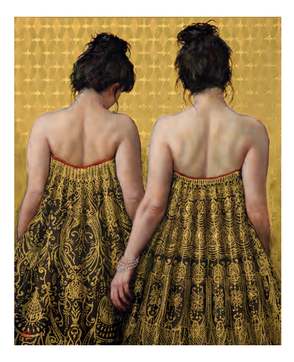
Gemini Oil and 24ct gold leaf on panel 20 x 16 inches