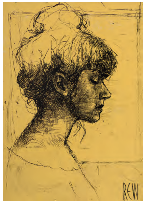
Study of Beth in Profile Eglomise 'Etching on 24ct Gilded Glass' 8 x 6 inches