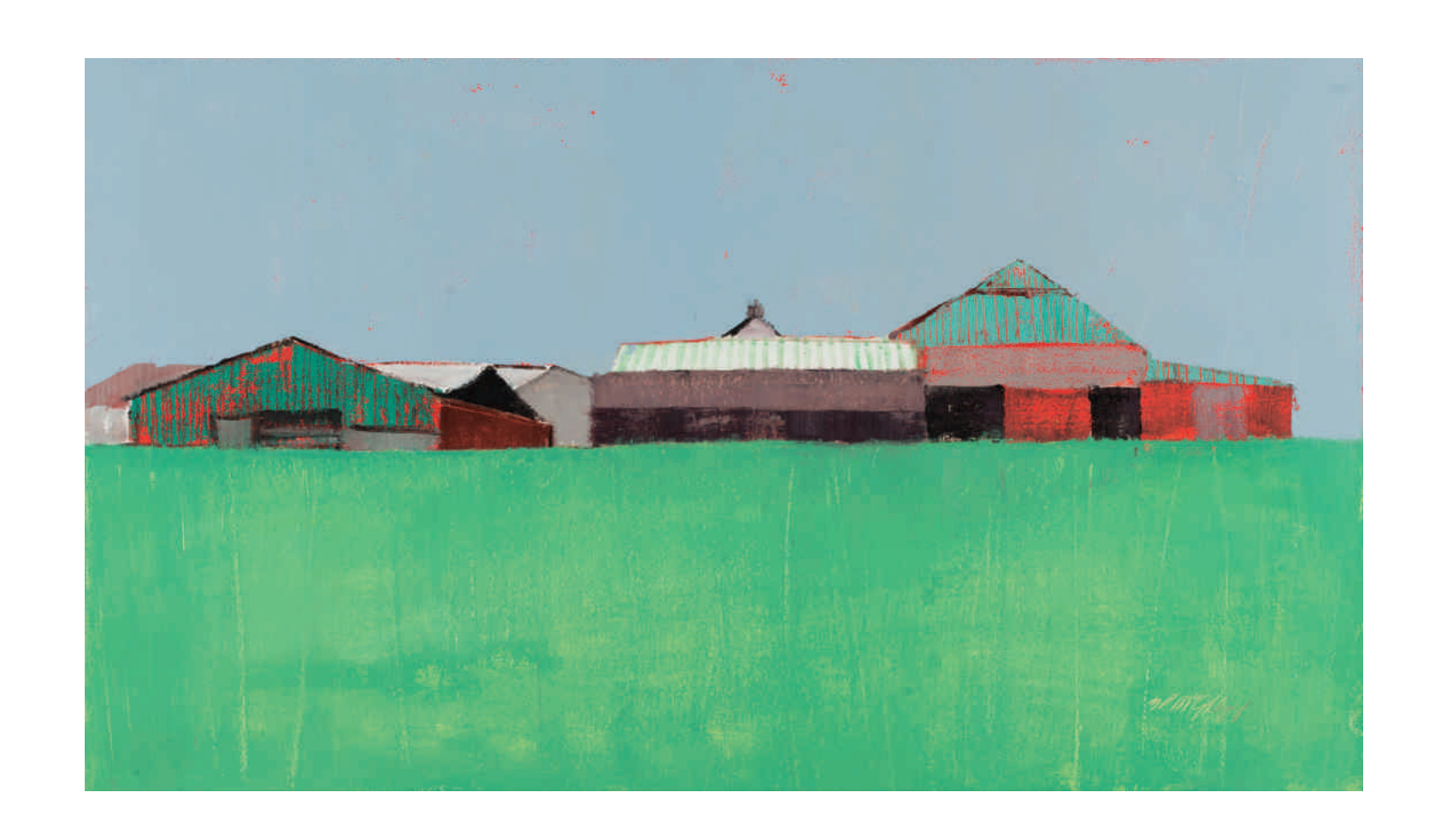
Kepculloch, Stirlingshire Oil 18 x 31 inches