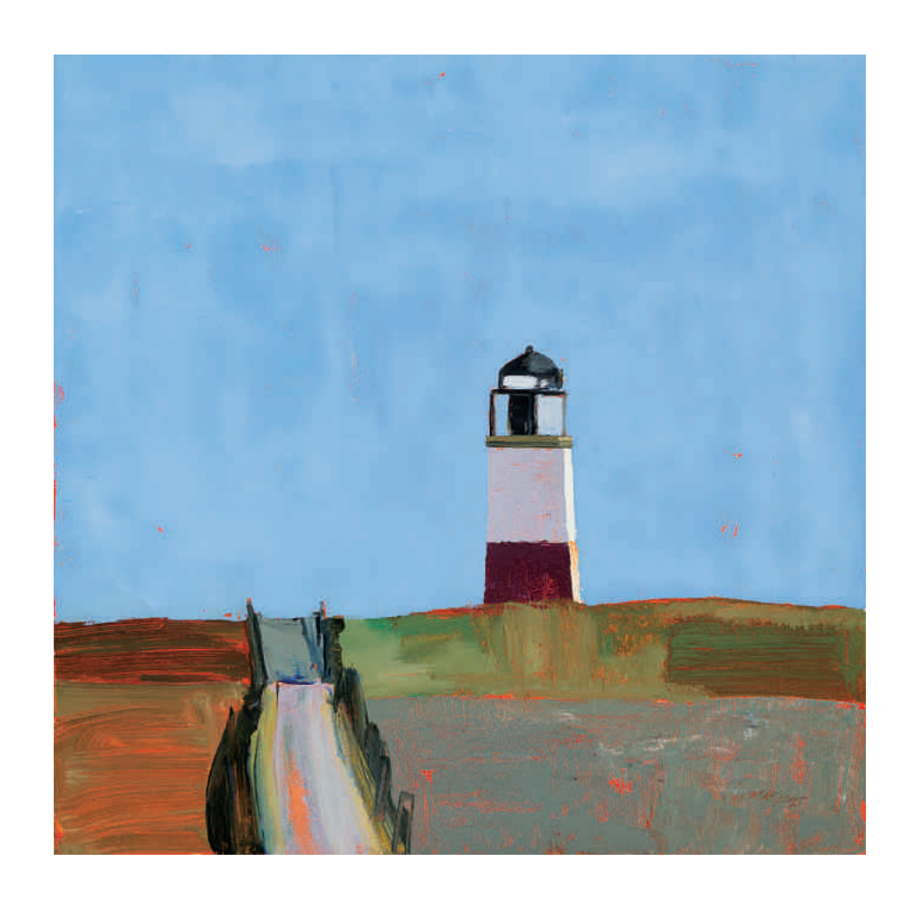
Clythness, Sutherland Oil 30 x 30 inches