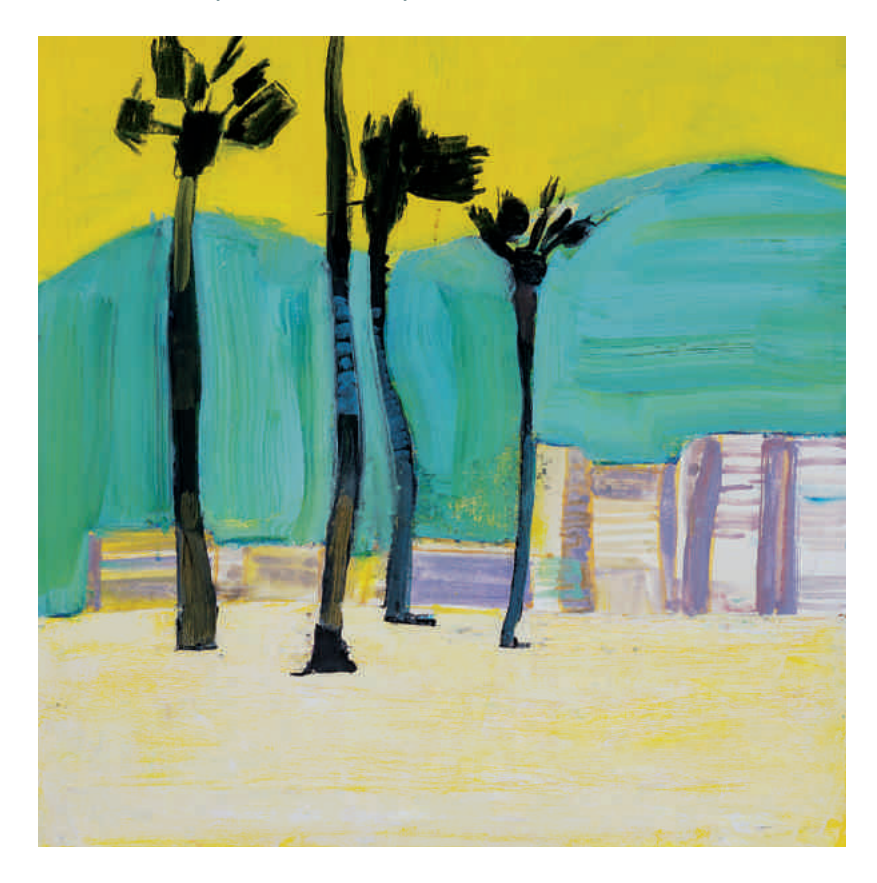
Calm, cool and breezy, I paint first thing in the morning before the arrival of bustle. And the muscle.

Venice Beach, California Oil 27 x 27 inches