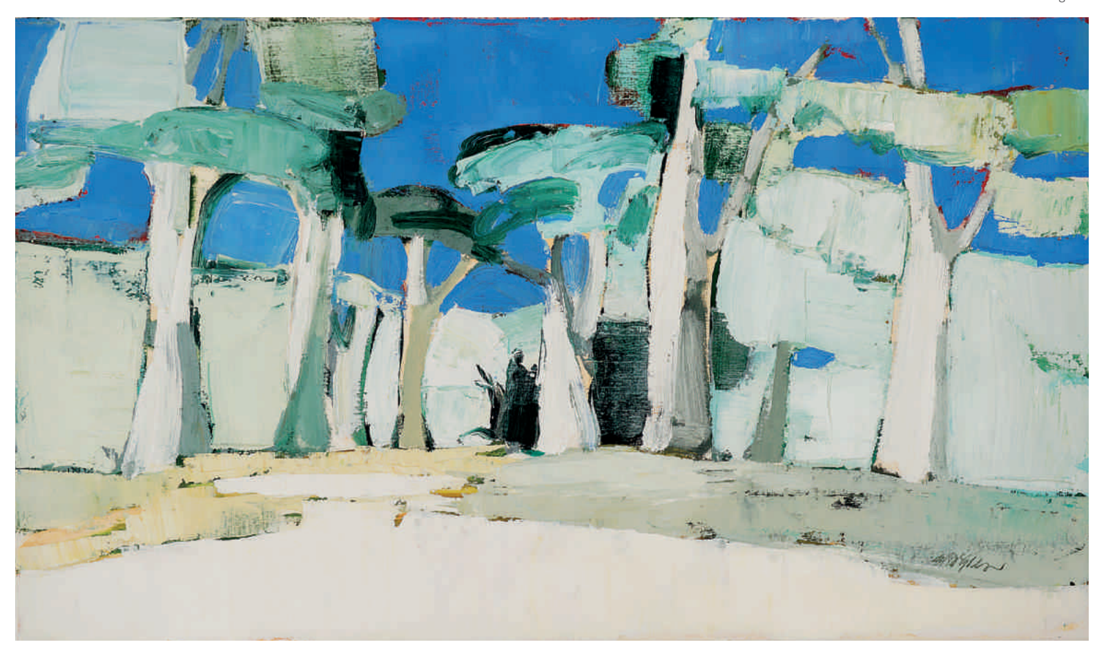
Italowie Gorge, South Australia Oil 18 x 31 inches