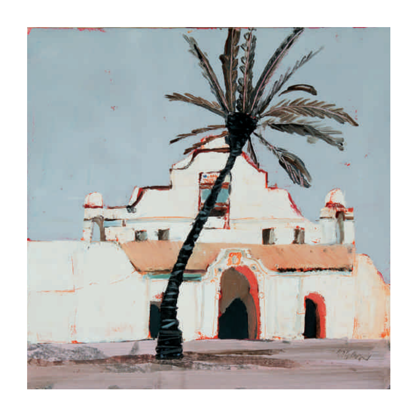
San Gabriel Arcangel, California Oil 27 x 27 inches