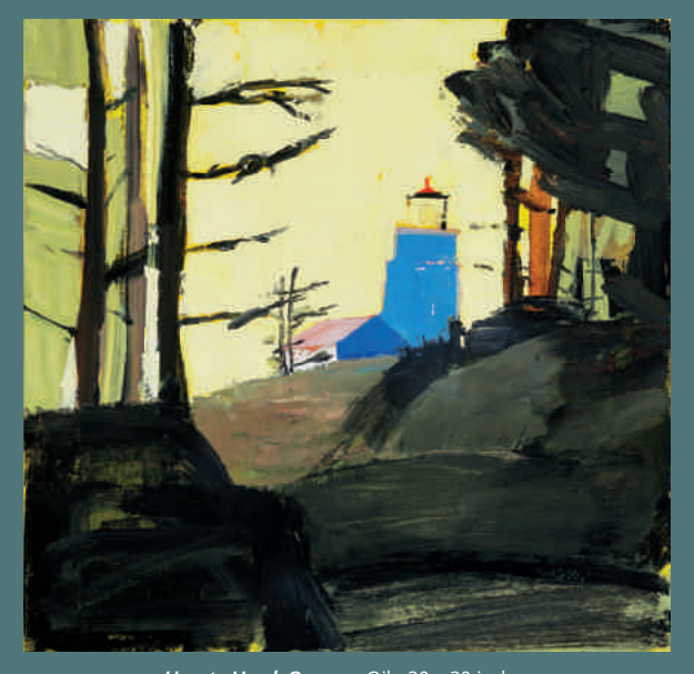
Heceta Head, Oregon Oil 30 x 30 inches