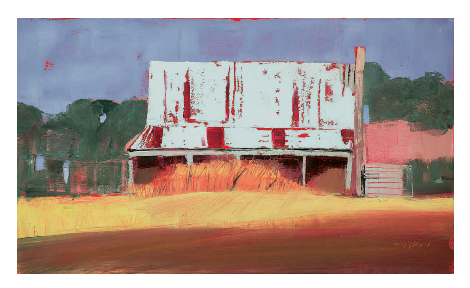
Costerfield, Victoria Oil 18 x 31 inches