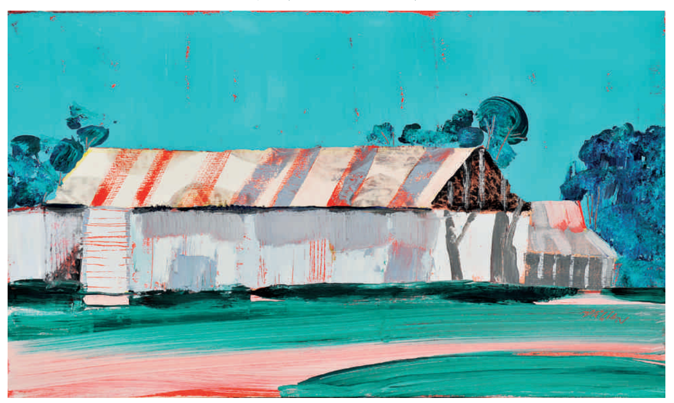
At the end of the day I sat on the corner of town to paint this grand, historic hotel, on the old Sydney to Melbourne mail route. The guide books say it's quieter here since the freeway opened, but not today as everyone stops to say hello, including the proud owner. He seems pleased.