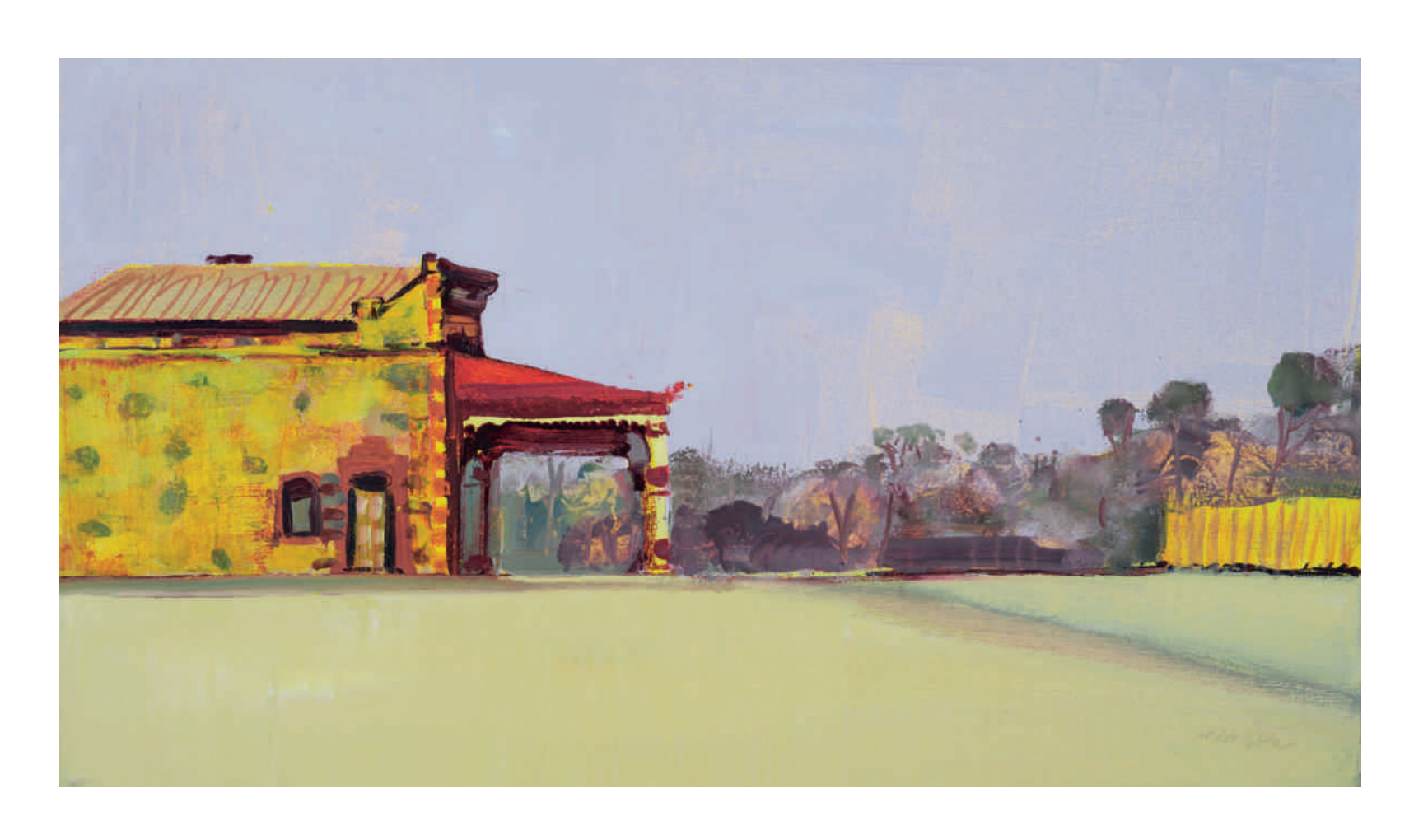
Silverton, New South Wales Oil 18 x 31 inches