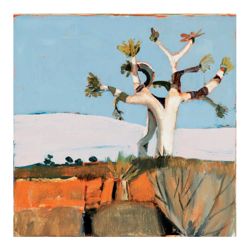
Joshua Tree, California Oil 21 x 21 inches