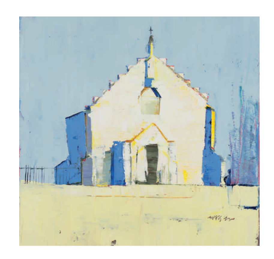
Kirk O'Shotts Lanarkshire Oil 20 x 20 inches