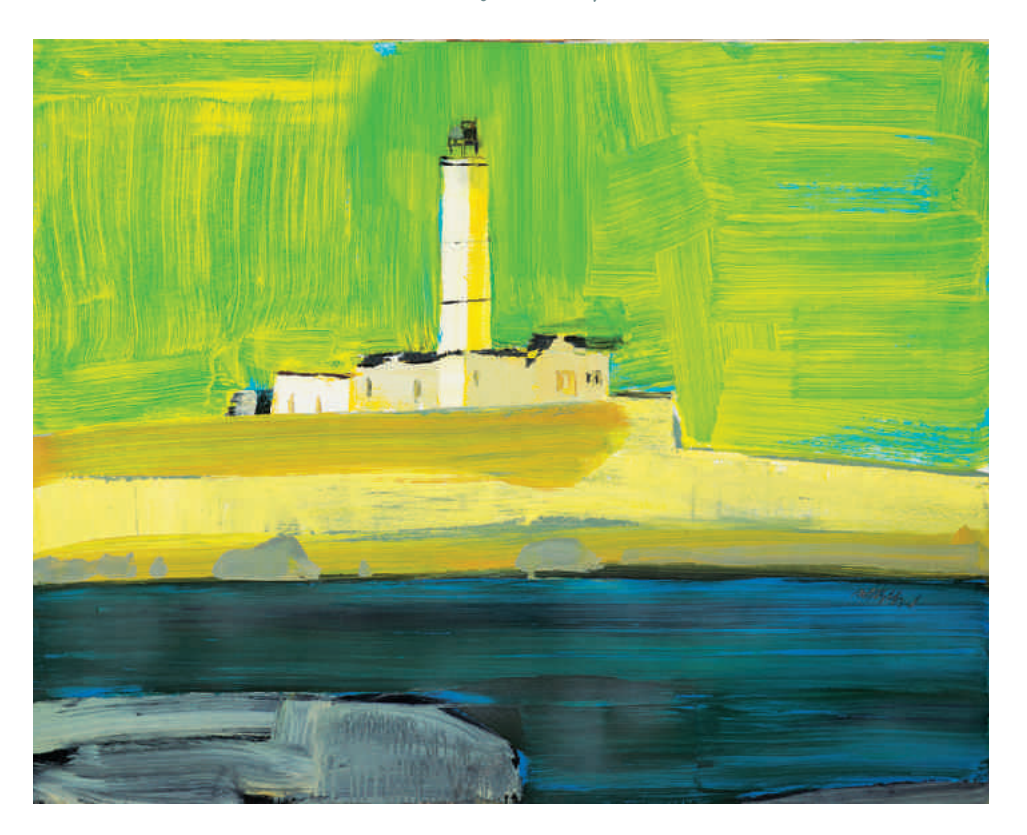
Walking towards the shore I catch the faint sound of children playing on the still-hidden beach. Getting closer, it sounds more like barking dogs. Then I see the seals, dozens and dozens of them, shouting at the tops of their voices.