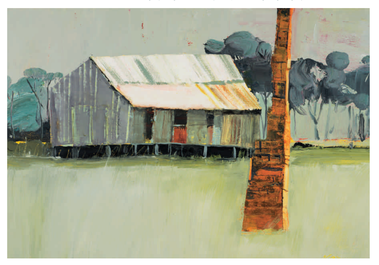
Old Shed, Victoria Oil 24 x 32 inches