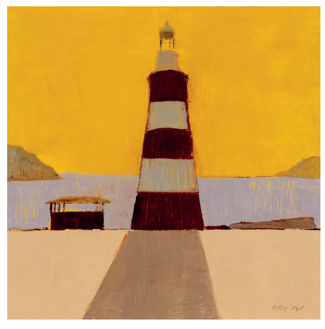
Plymouth Oil on canvas 20 x 20 inches