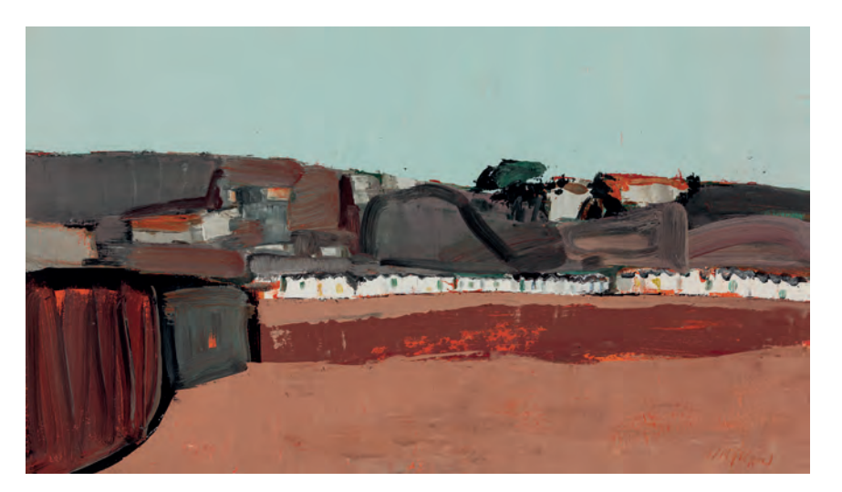
Torbay Beach Huts Oil on canvas 18 x 31 inches