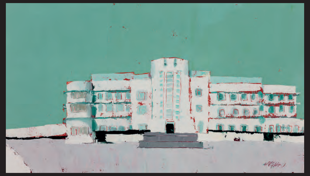
Midland Hotel, Beach Front Oil on canvas 12 x 24 inches

Oil on canvas 14 x 14 inches (front cover)