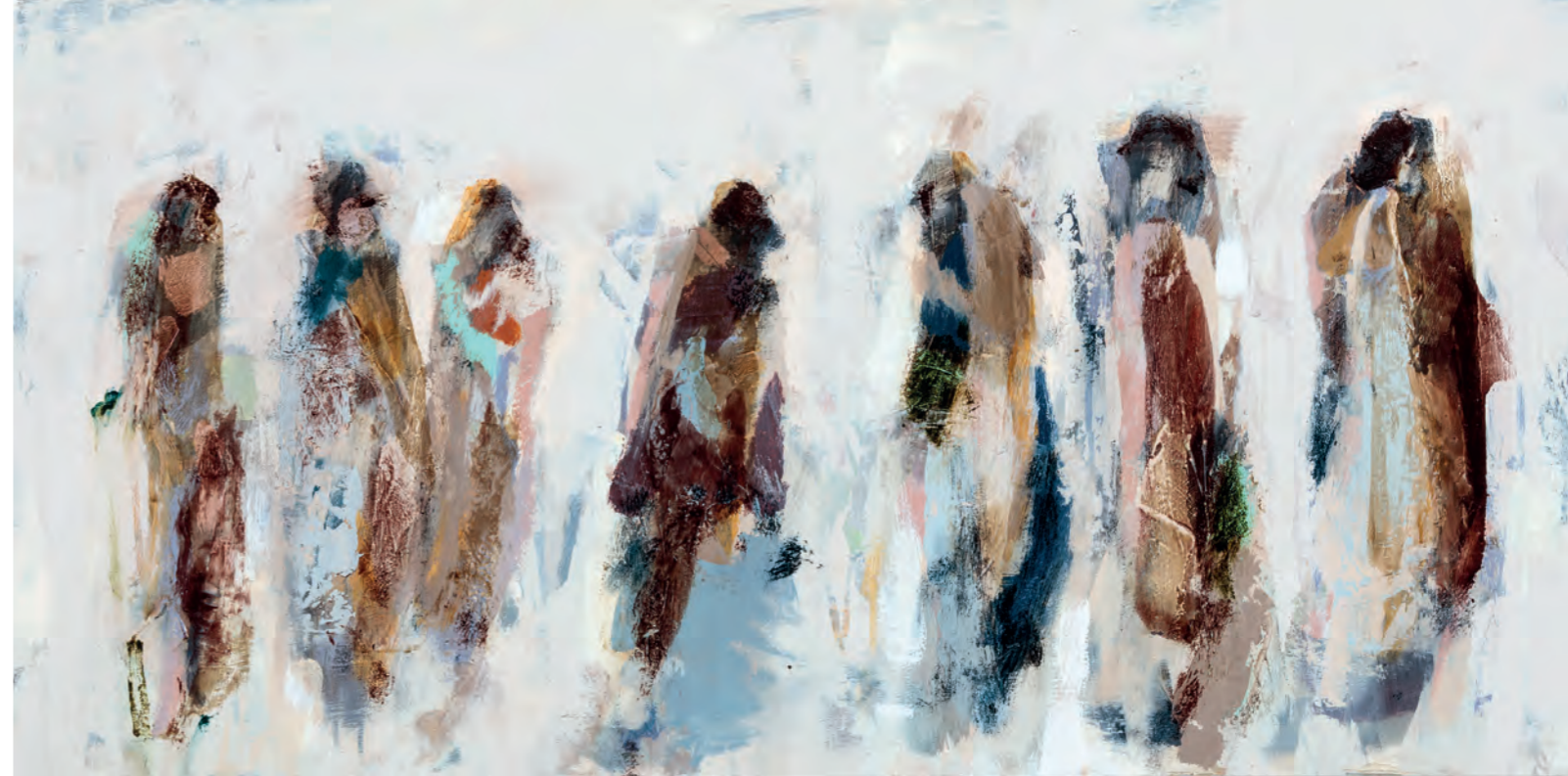
BEN LOWE Mother Figures Oil on panel 16 x 32 inches