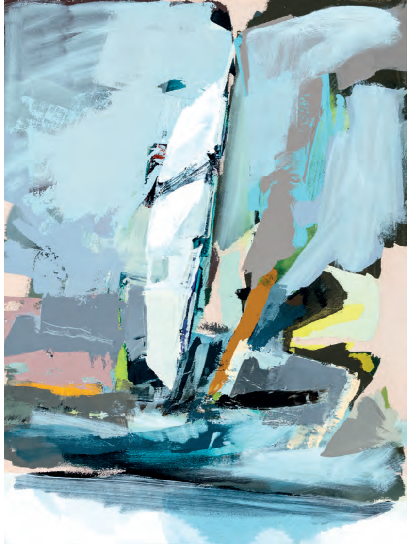
BEN LOWE Hello, Sailor! Oil on canvas 32 x 24 inches