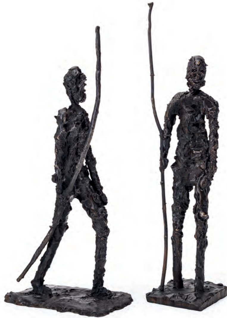
GUS FARNES Quest Bronze 6 x 3 x 13 inches