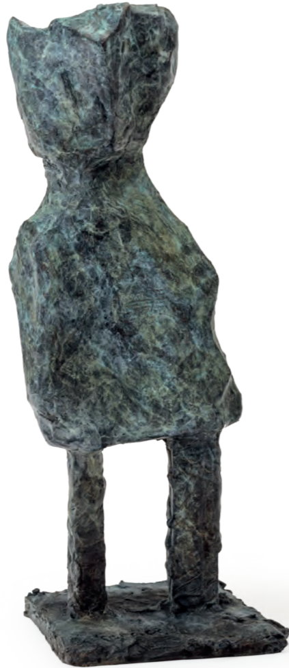
GUS FARNES Outcrop Bronze 3 x 3 x 9 inches