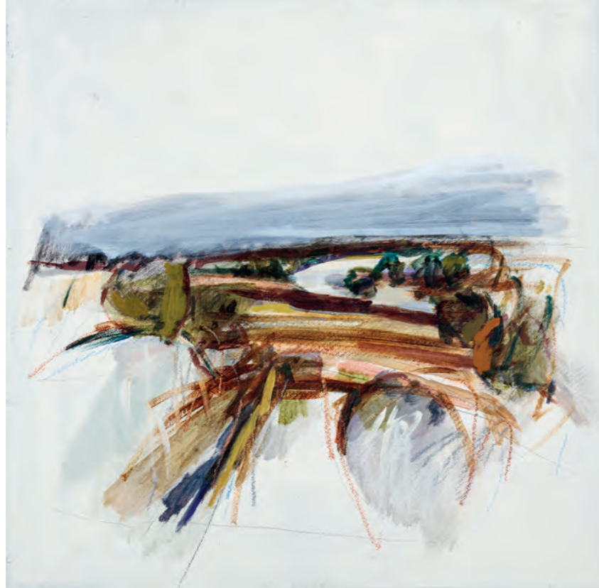
BEN LOWE Richmond Hill Acrylic and oil on linen 30 x 30 inches