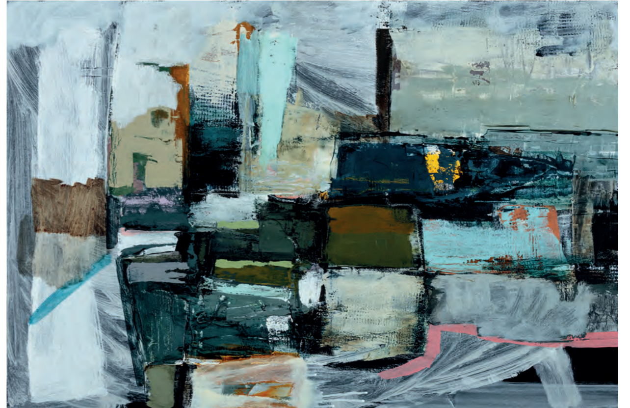
BEN LOWE Don't Know When Oil on canvas 23 x 35 inches