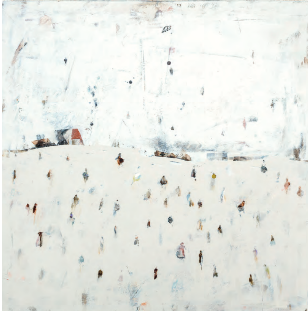
BEN LOWE Leaver's Party Oil on canvas 47 x 47 inches