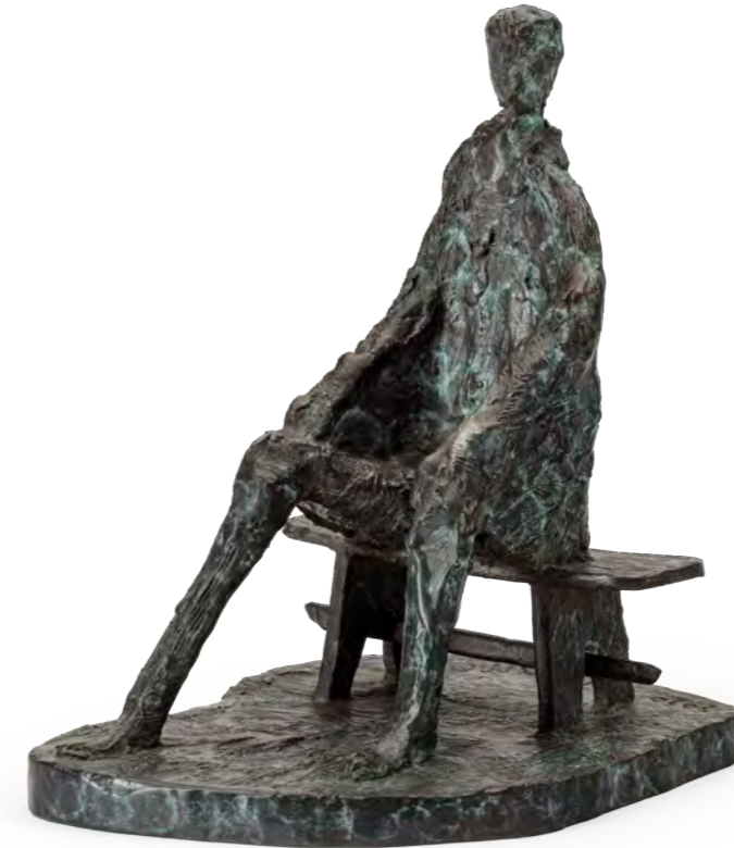
GUS FARNES Seated Gentleman Bronze 4 x 6 x 7 inches

In his latest collection, Nightingales and Bombers , graphic designer-turned-artist Ben Lowe extends an ongoing meditation on the visual and emotional dimensions of colour. The compositions correspond more to a deeply felt personal experience than to a particular time or place, and the visual gradients rendered on each canvas express the emotional gradients of its fundamental essence. These paintings whisper, they intrigue and they emote.