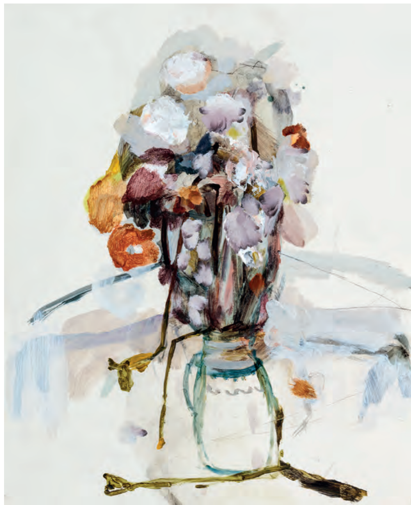
BEN LOWE Lousy Bunch Oil on panel 30 x 24 inches