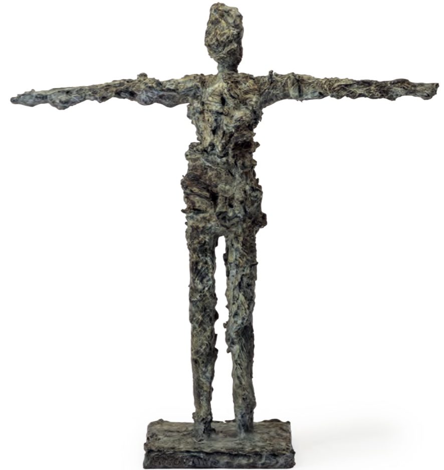
GUS FARNES Outstretched Bronze 9 x 3 x 10 inches