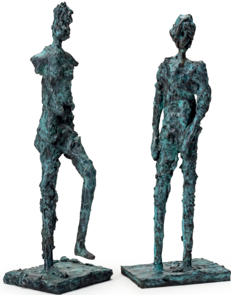
GUS FARNES Standing with Right Leg Maquette Bronze 3 x 3 x 11 inches