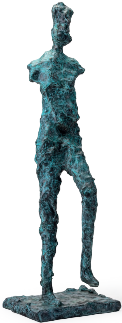
GUS FARNES Standing on the Right leg Maquette Bronze 3 x 3 x 11 inches