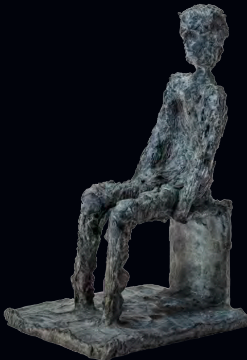
GUS FARNES Ponder