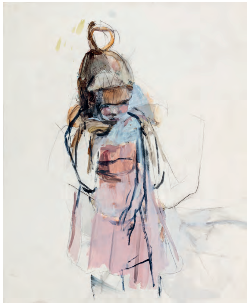
BEN LOWE Portrait of a Young Girl Oil on panel 30 x 24 inches