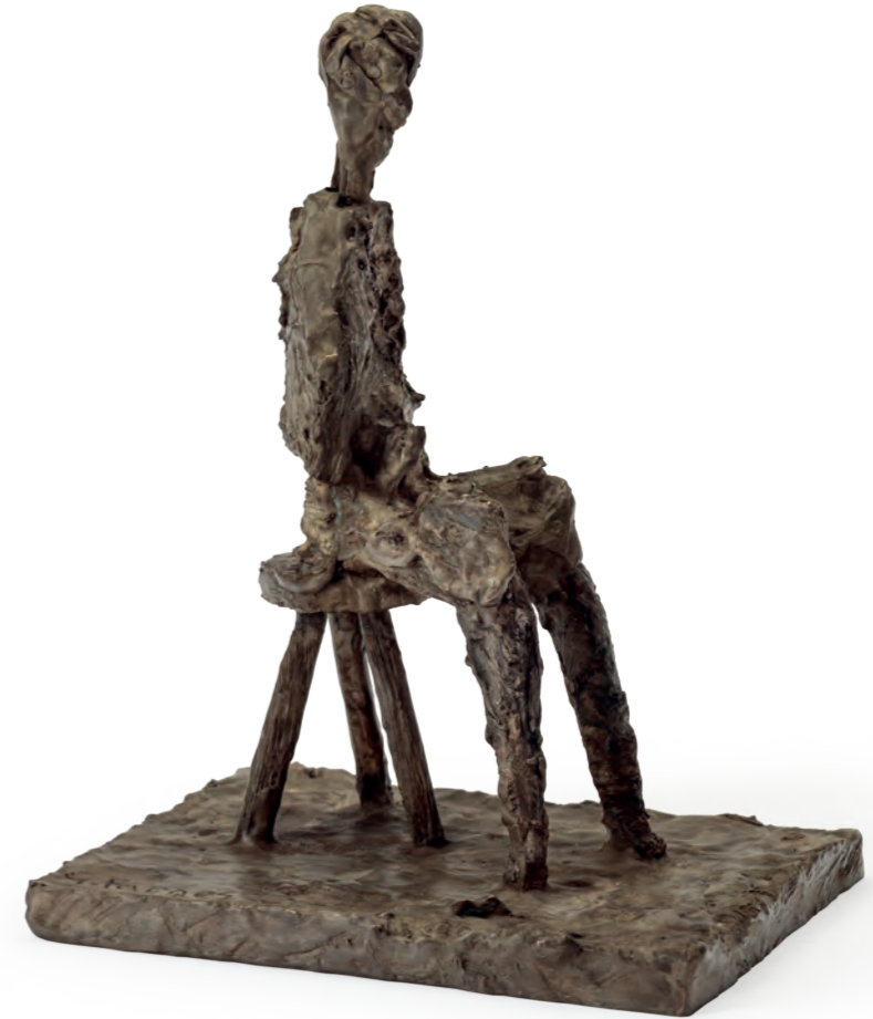
GUS FARNES Legged Bronze 4 x 5 x 7 inches