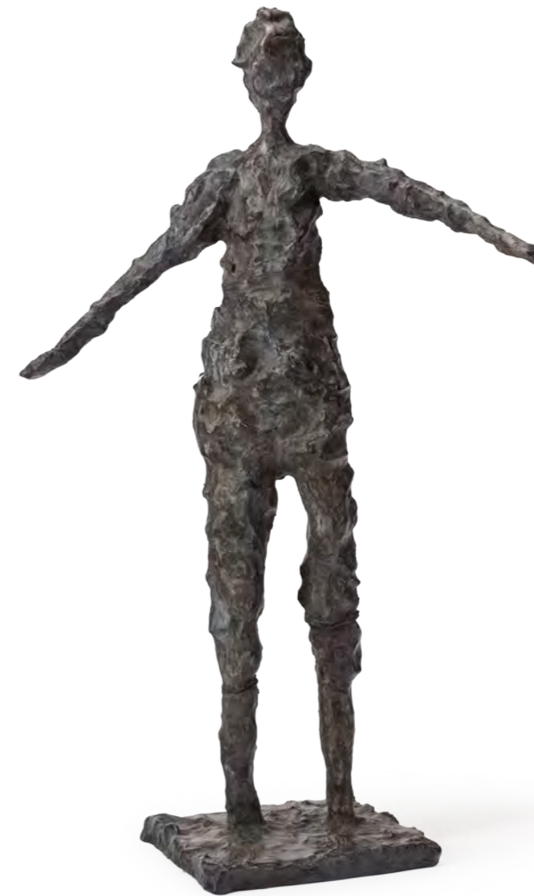
GUS FARNES Turning Motive Bronze 3 x 3 x 11 inches