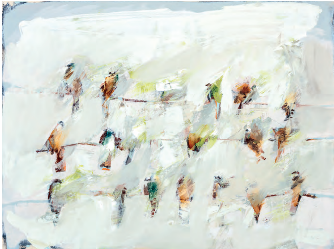
BEN LOWE Birds of a Feather Oil on panel 30 x 40 inches