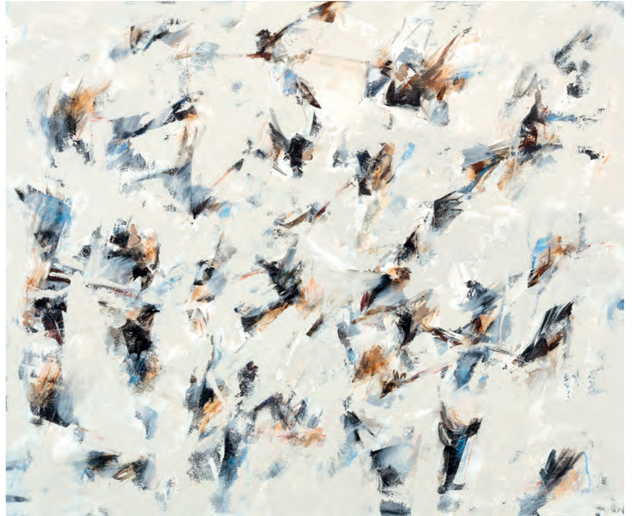
BEN LOWE Jays Oil on canvas 36 x 43 inches