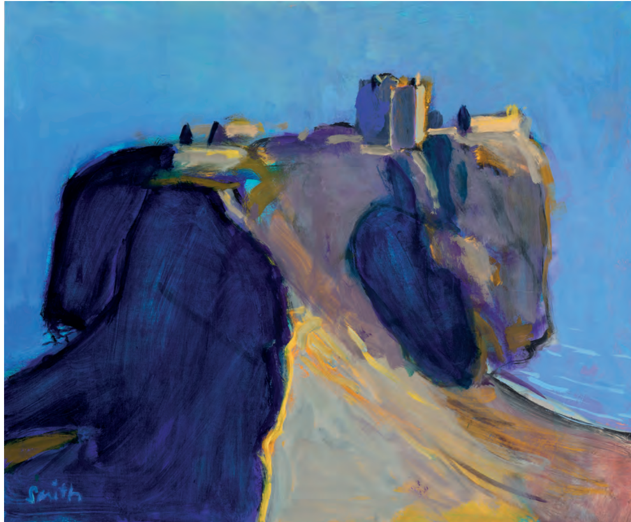
Dunnottar Castle Oil on board 25 x 30 inches