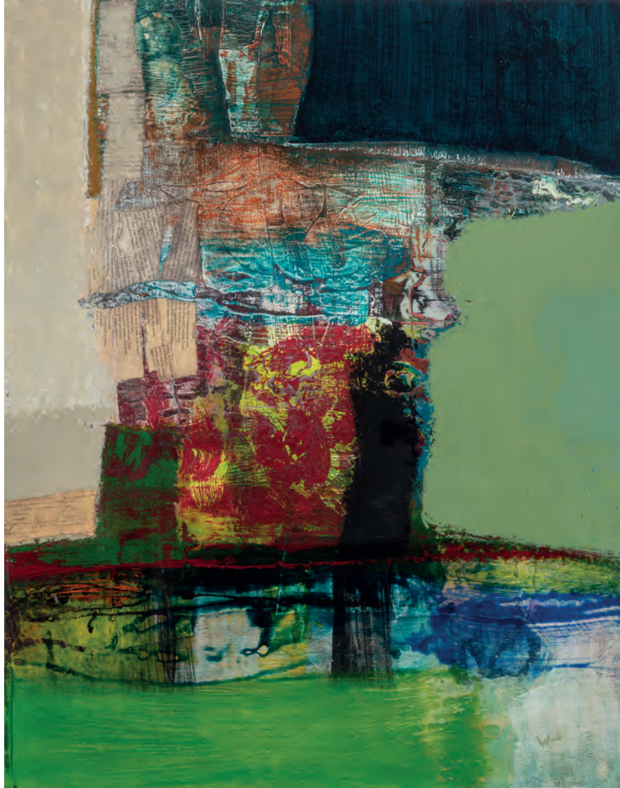
Down the Other Air Mixed media and collage on panel 30 x 24 inches