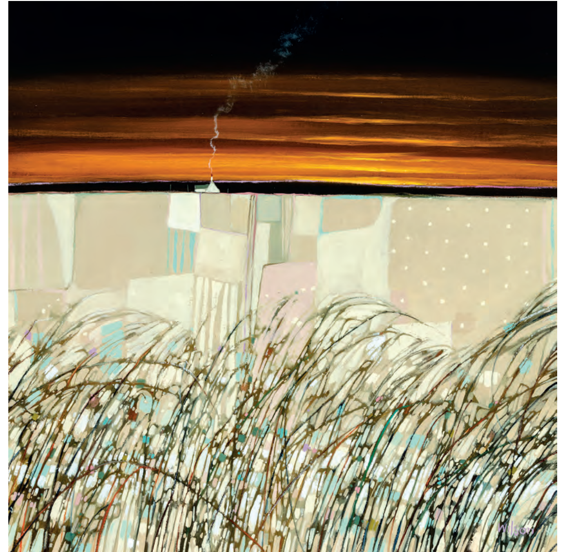
The Arran Grasses Oil on board 20 x 20 inches