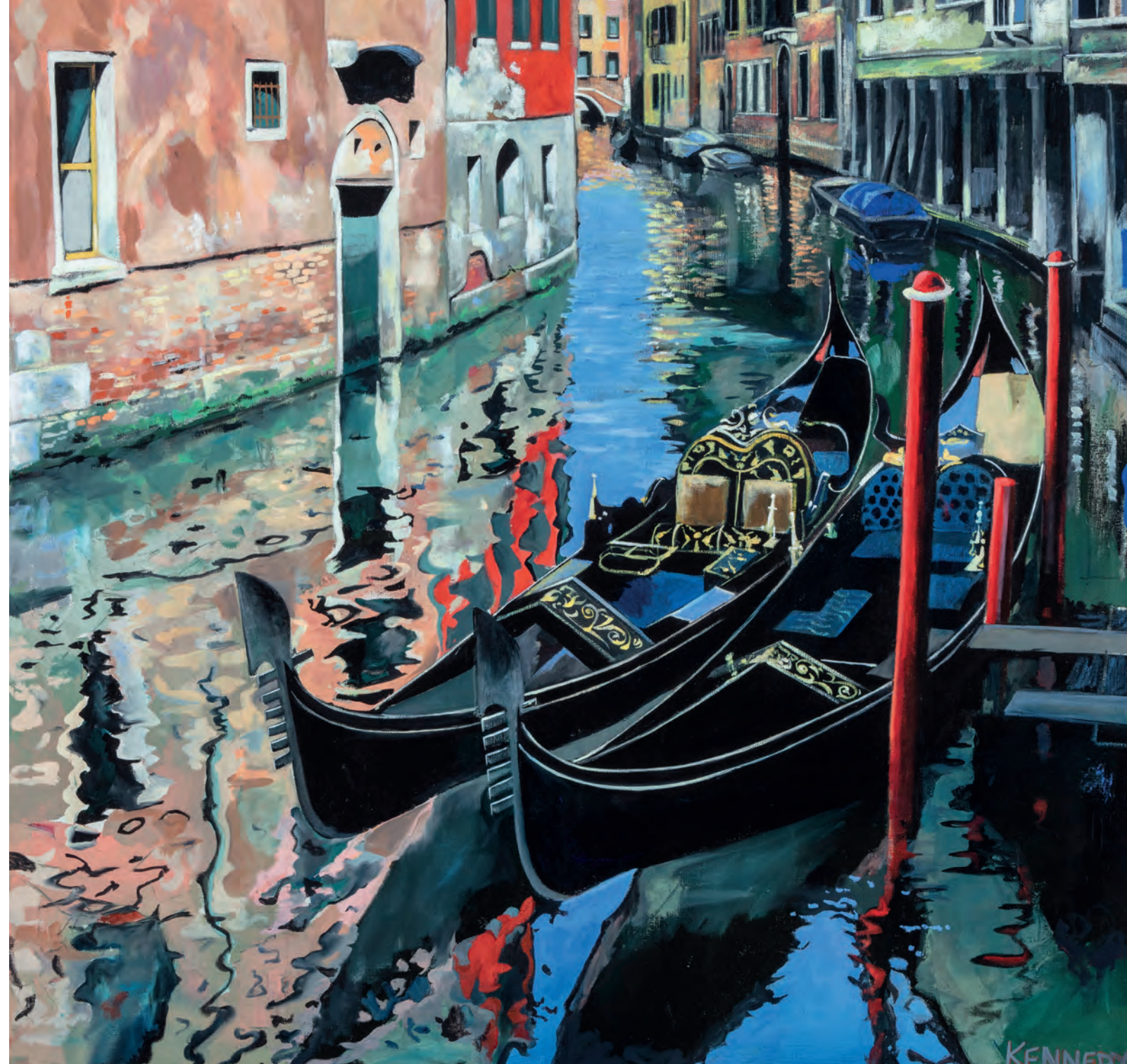
Canal View Oil on linen 39.5 x 39.5 inches (right)