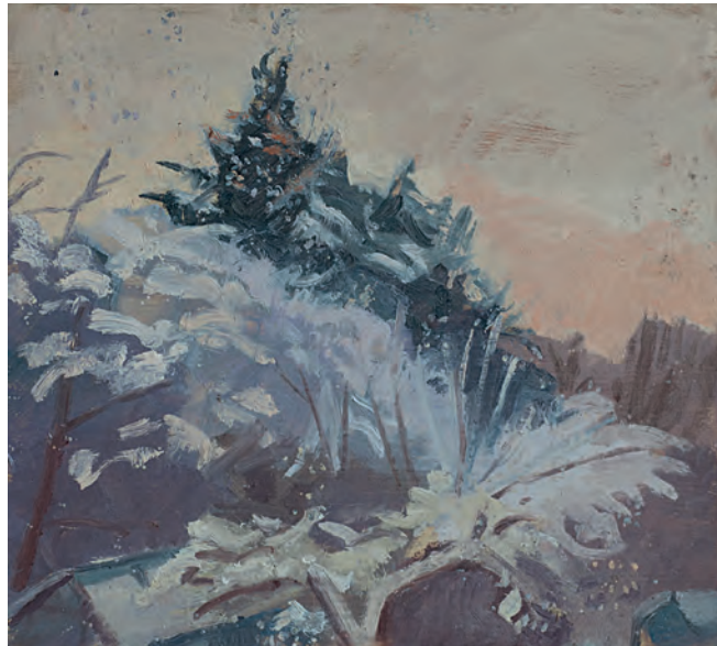
Snowy Solstice Oil on panel 10 x 11 inches