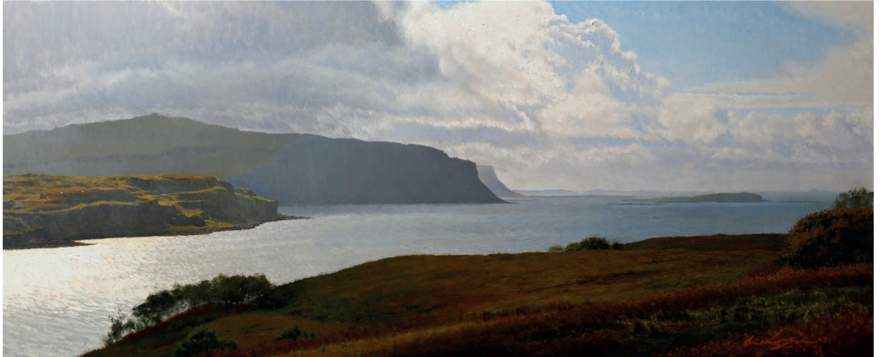
Song of Farewell (Eorsa, Gribun, Inch Kenneth) Oil on canvas 19.5 x 47 inches