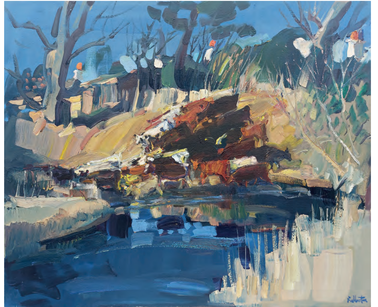
Cattle at Riverside Oil on canvas 30 x 36 inches