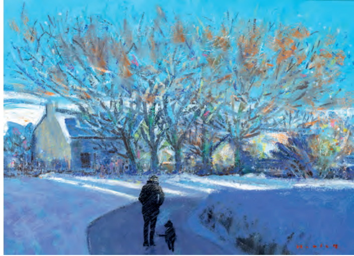
Sunlit Road, Bend in Snow Oil on canvas 12 x 16 inches