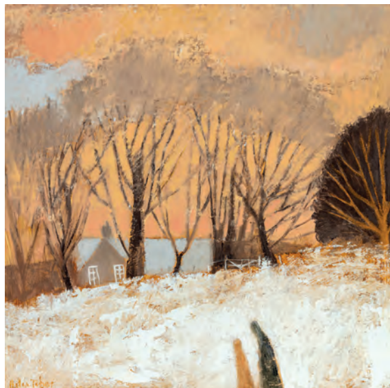
January Afternoon Oil on board 18 x 18 inches