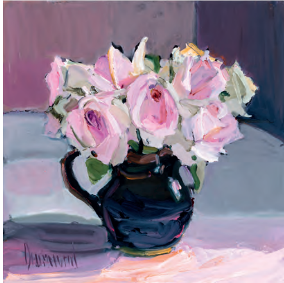
Palest Pink Roses Oil on board 16 x 16 inches