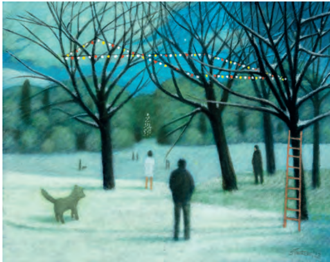
Lights Oil on board 16 x 20 inches