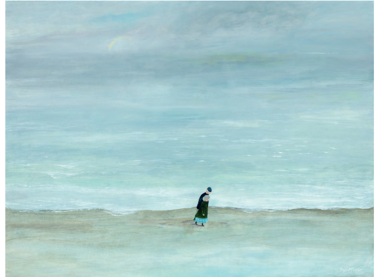
You, Me and the Sea Acrylic on board 23.5 x 31.5 inches