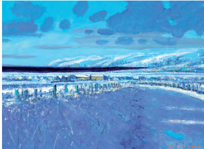
Snowfall on the Mull of Kintyre Oil on canvas 12 x 16 inches