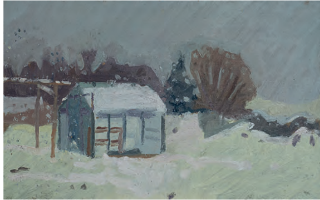
Winter Garden Oil on panel 7.5 x 12 inches