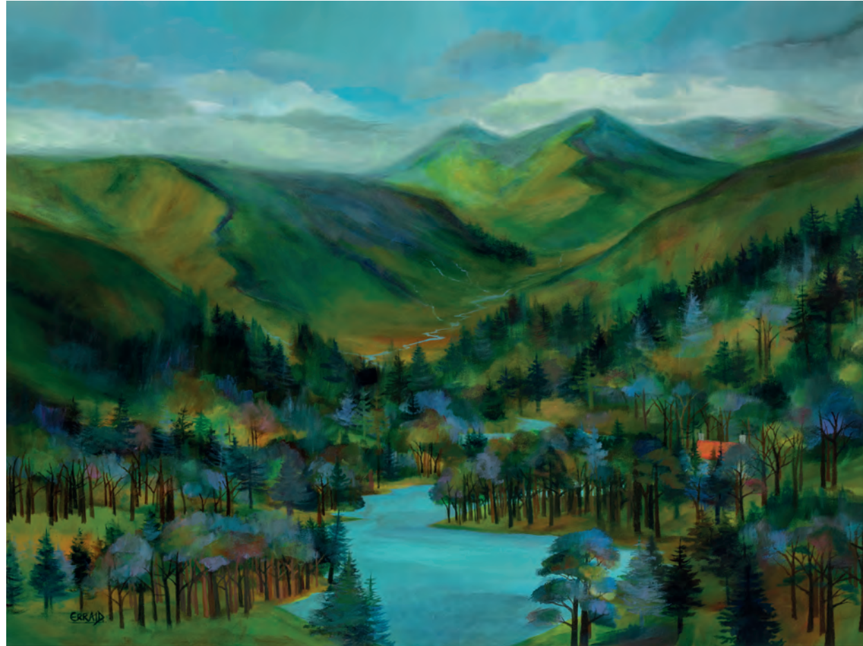
The Red Roof Hut, Cumbria Acrylic, oil and oil pastel 29.5 x 39.5 inches