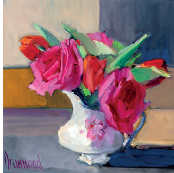
Little Porcelain Jug Oil on board 12 x 12 inches