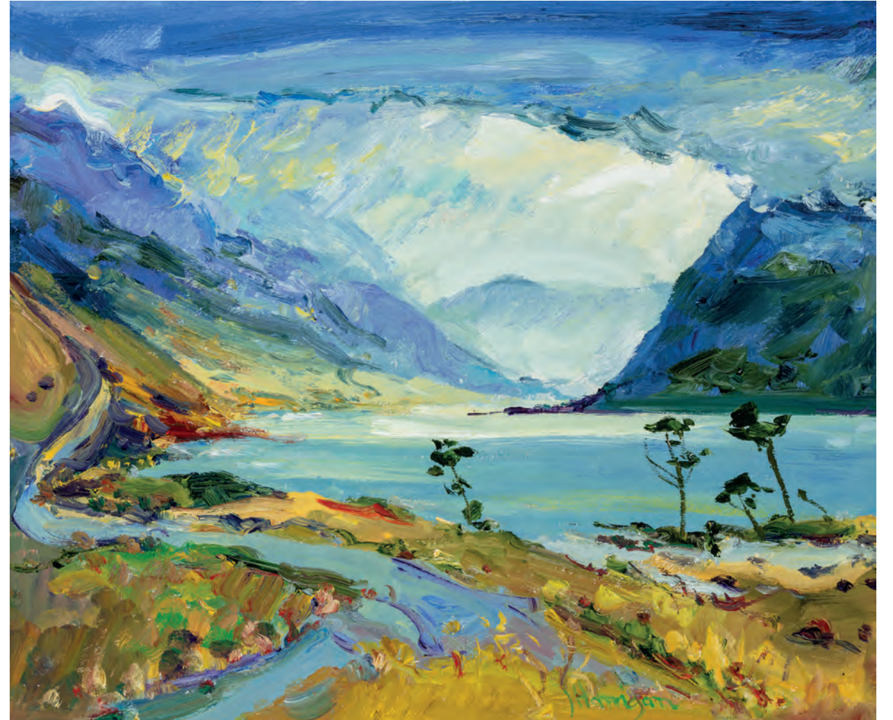
Loch Assynt Oil on board 20 x 24 inches