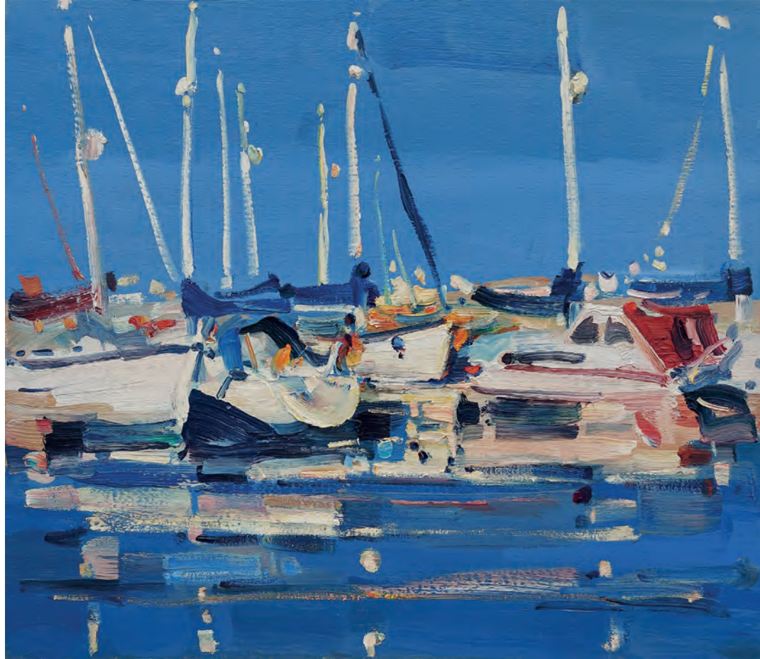
White Yachts at Troon Oil on canvas 26 x 30 inches