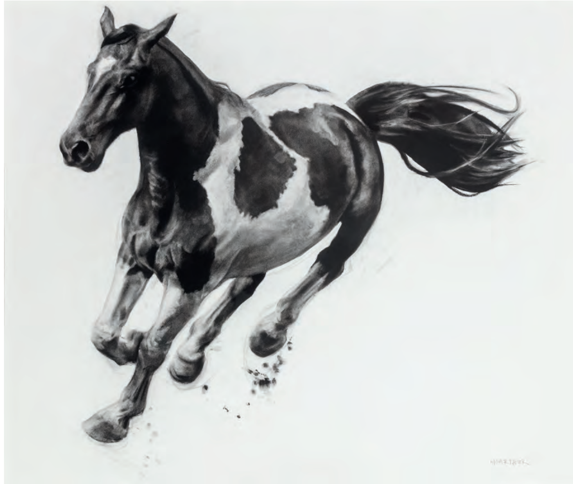
The Charge Charcoal on paper 35.5 x 43.5 inches