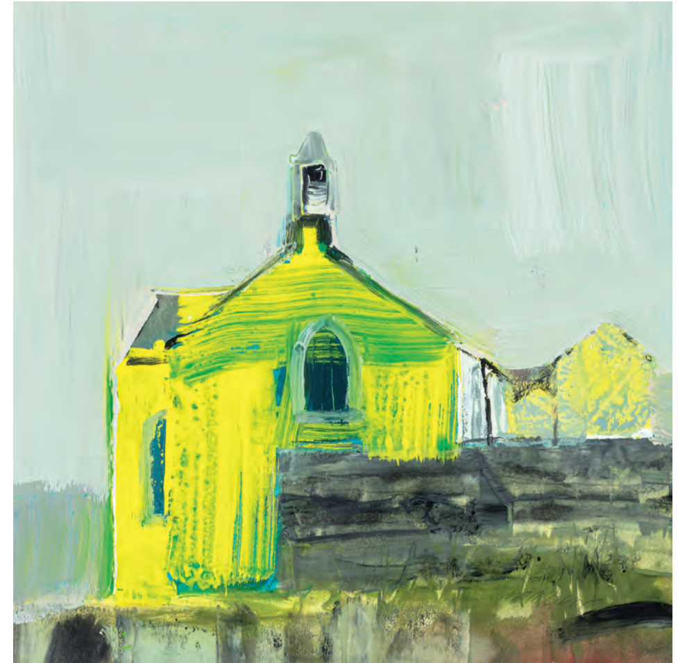
Strathaven Parish Church, Islay Gouache 14 x 14 inches