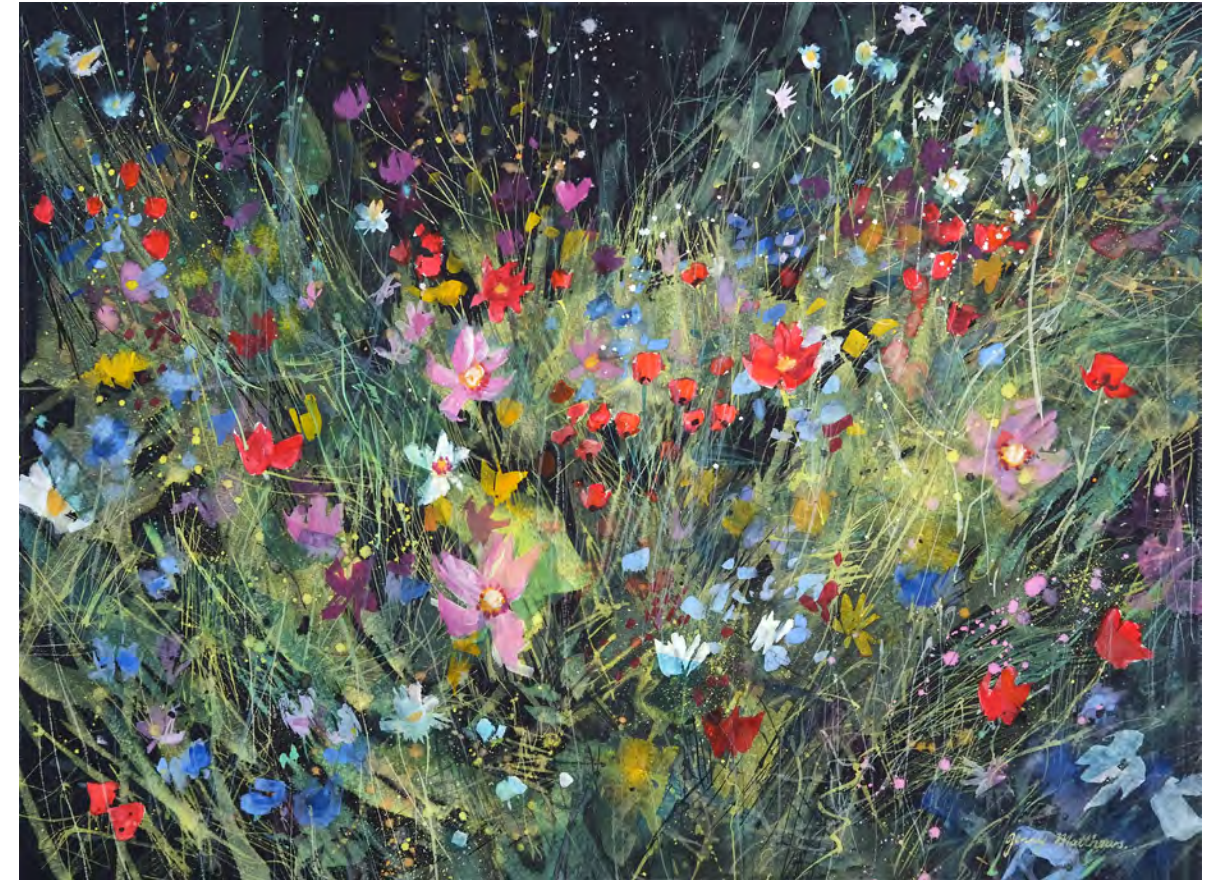
Jewels Watercolour and gouache on black watercolour paper 12 x 16 inches