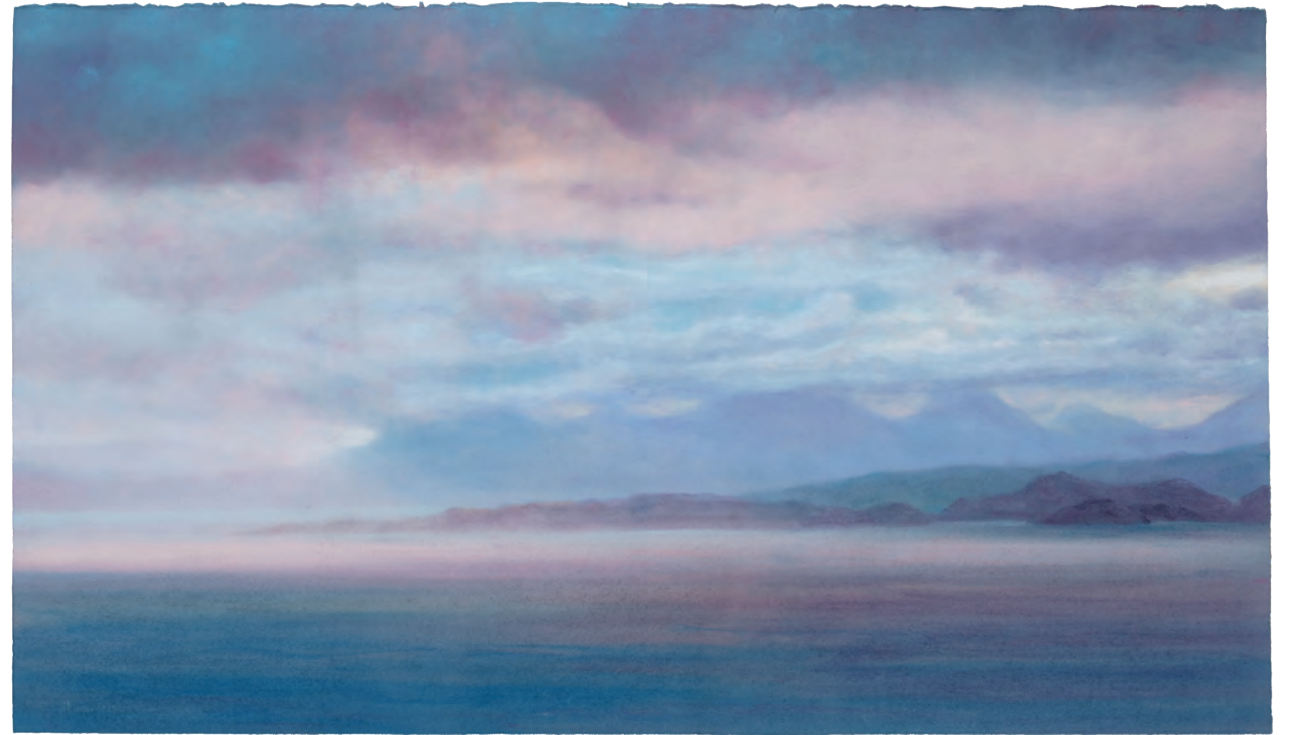
Enveloped Crepuscula Pastel on paper 16.5 x 22.5 inches (left)