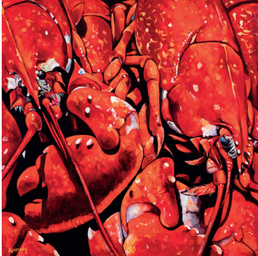
Reddy Oil on board 35.5 x 35.5 inches