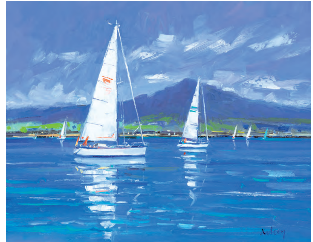
Sailing Regatta off Arran Oil on linen 16 x 20 inches