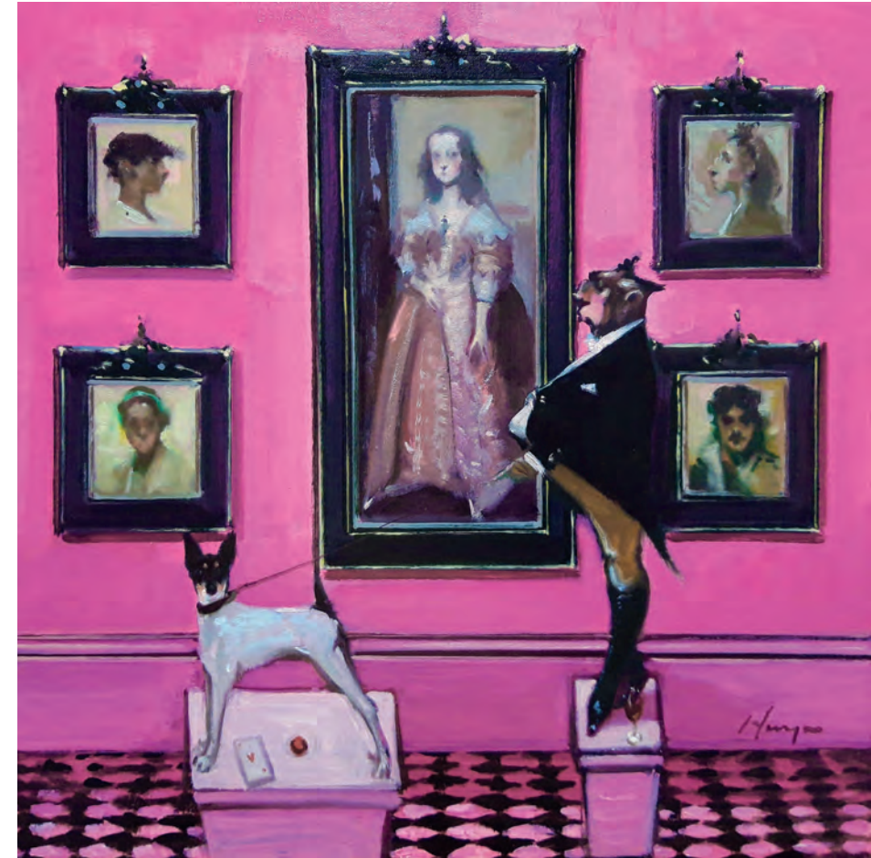
Tete a Tete Oil on canvas 20 x 20 inches