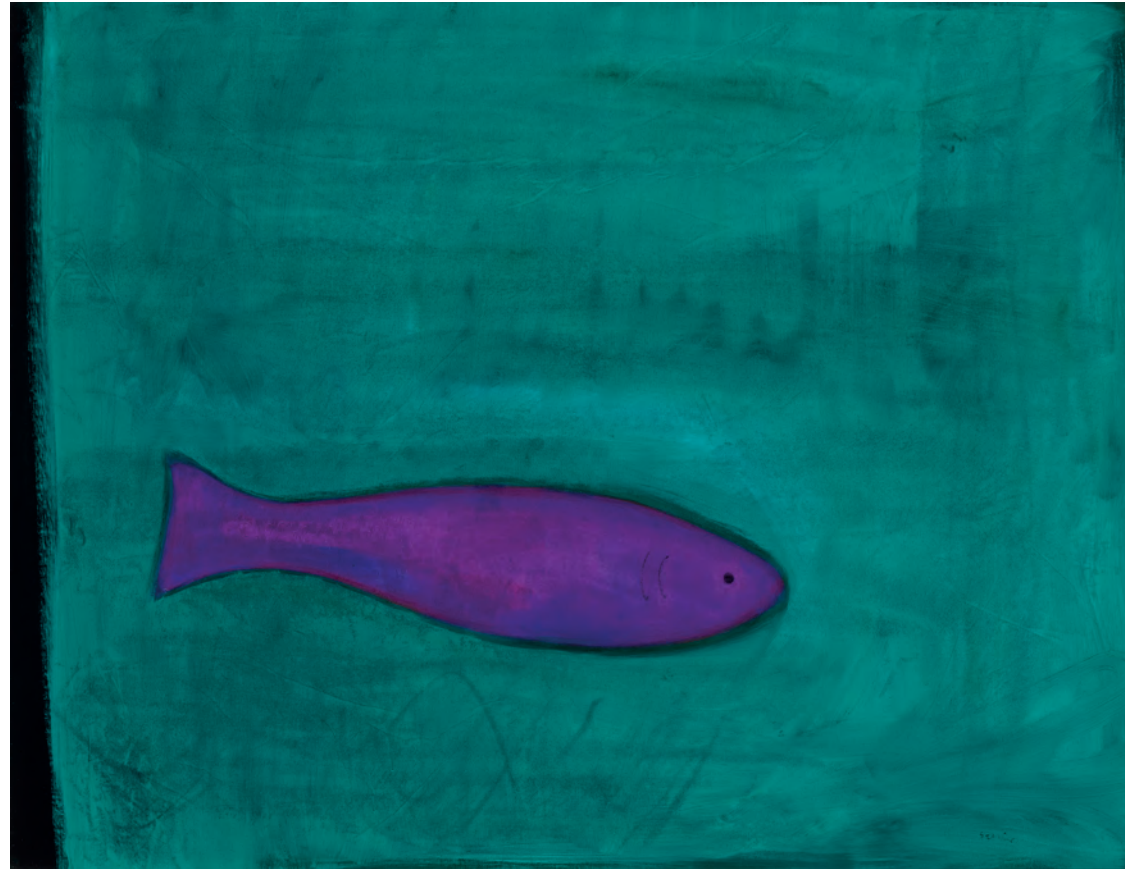
Fish Oil on canvas 28 x 36 inches