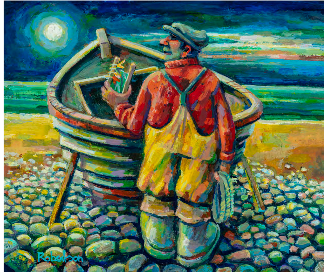
Night Fisher Oil on board 12 x 24 inches