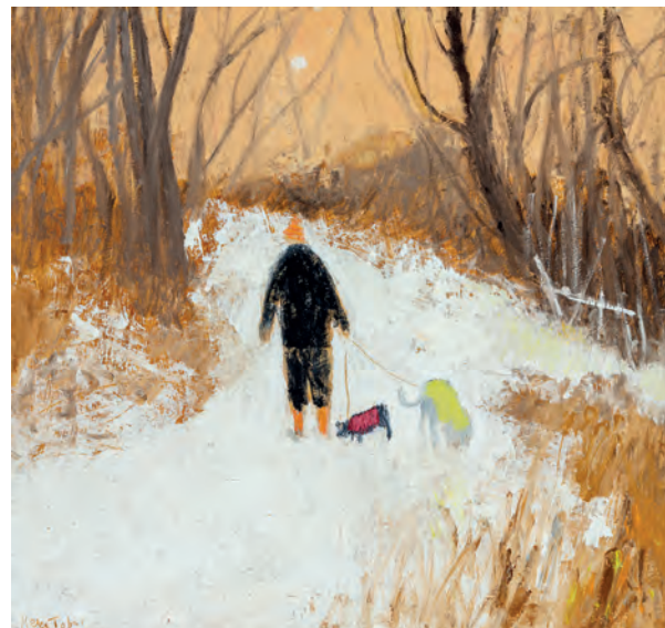
Walking in the Snow Oil on board 17 x 18 inches