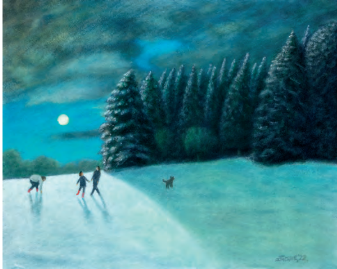
The Woods Are Lovely, Dark and Deep... Oil on board 16 x 20 inches