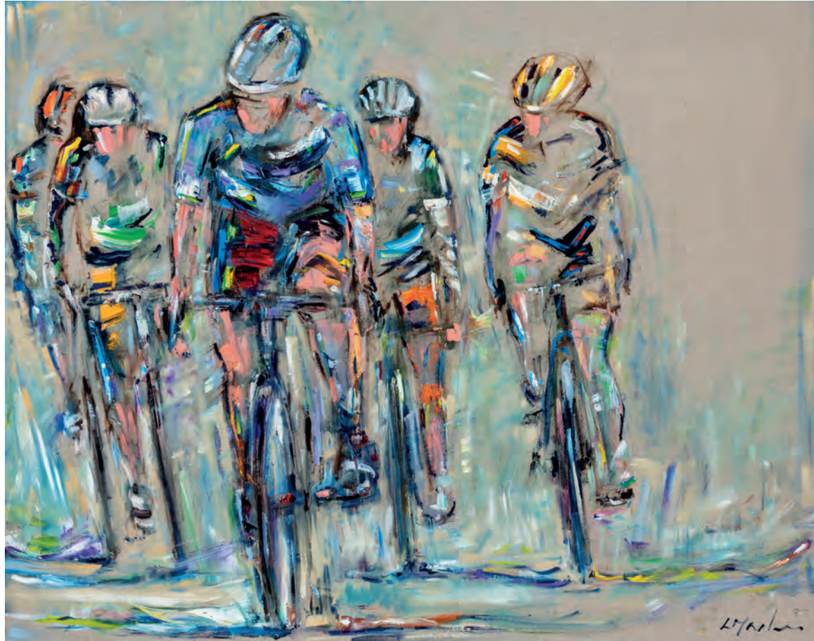
Sunday Morning Oil on raw linen 31.5 x 39.5 inches