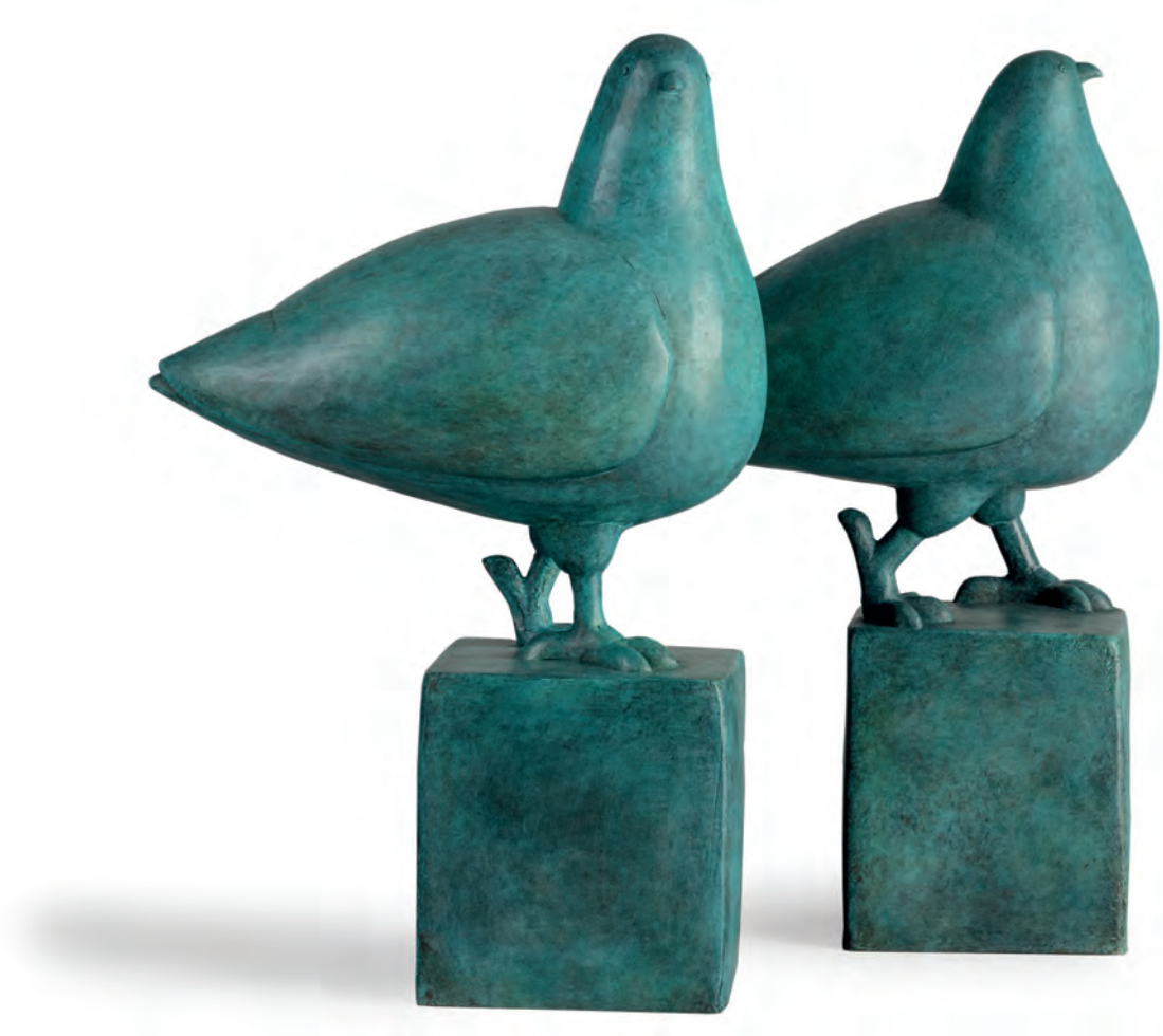
Surprise Bronze, Edition of 10 13 x 9 x 4 inches (left)