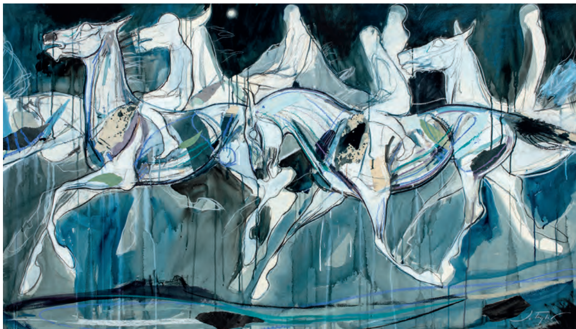
Moonlight Ride Mixed media on paper 34 x 59 inches