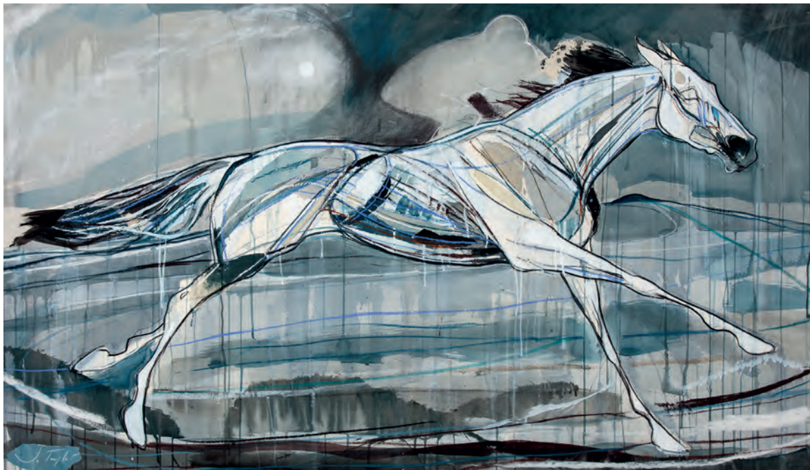
The Silver Horse Mixed media on paper 34 x 59 inches