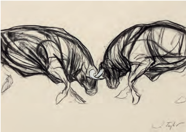
Dual Charcoal on paper 23 x 33 inches