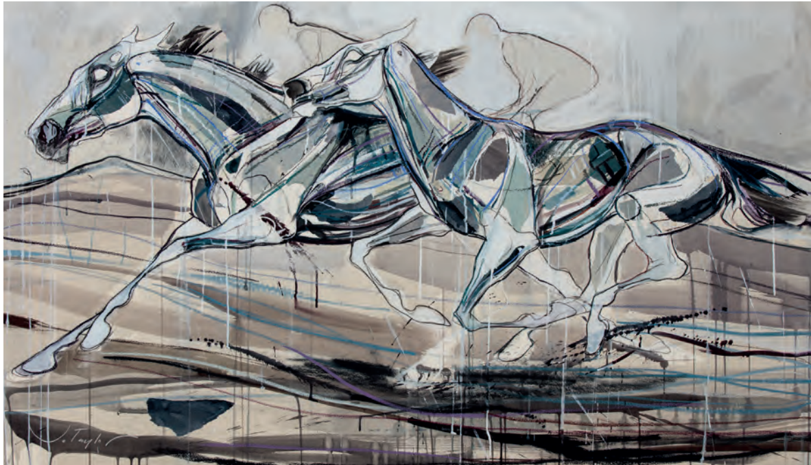
Wild Ride Mixed media on paper 34 x 59 inches