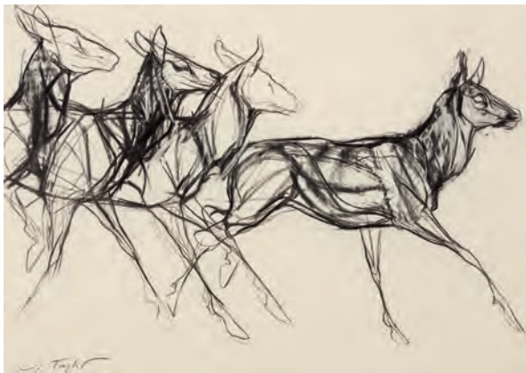
Wild Things Charcoal on paper 23 x 33 inches