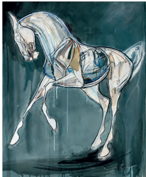
Horse in a Dream Mixed media on paper 33 x 28 inches