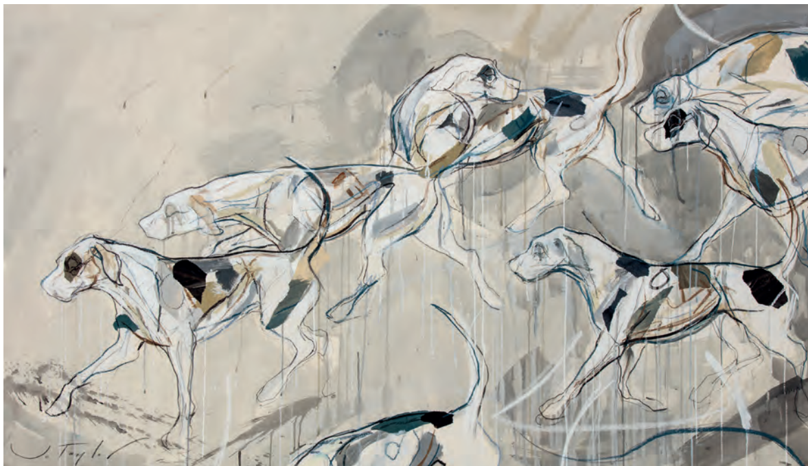
Hounds Mixed media on paper 34 x 59 inches