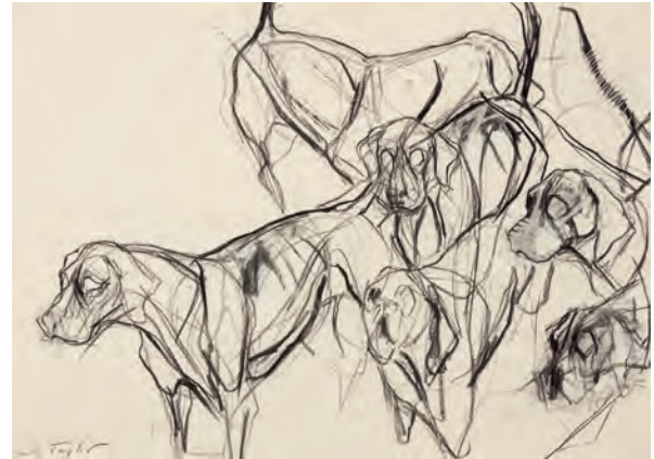
Hound Music Charcoal on paper 23 x 33 inches