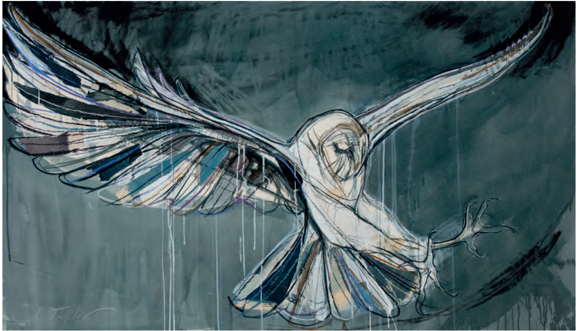
Velvet Darkness (Owl) Mixed media on paper 34 x 59 inches