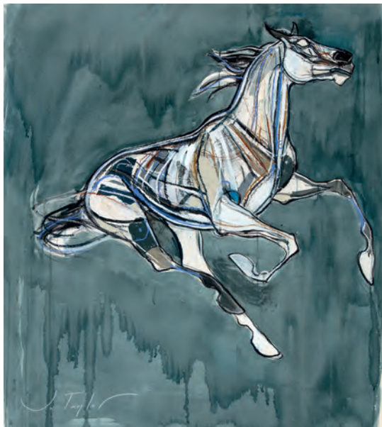
The Runaway Mixed media on paper 34 x 30 inches