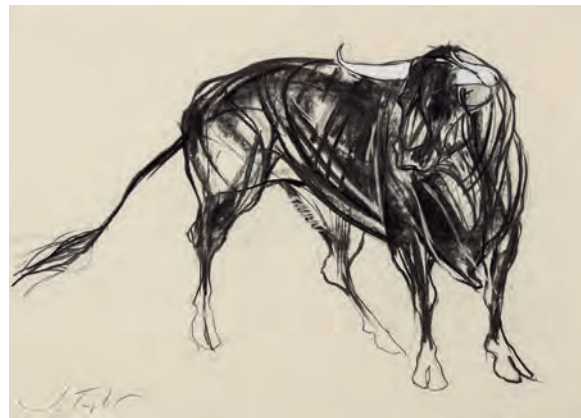
Sheer Power Charcoal on paper 23 x 33 inches