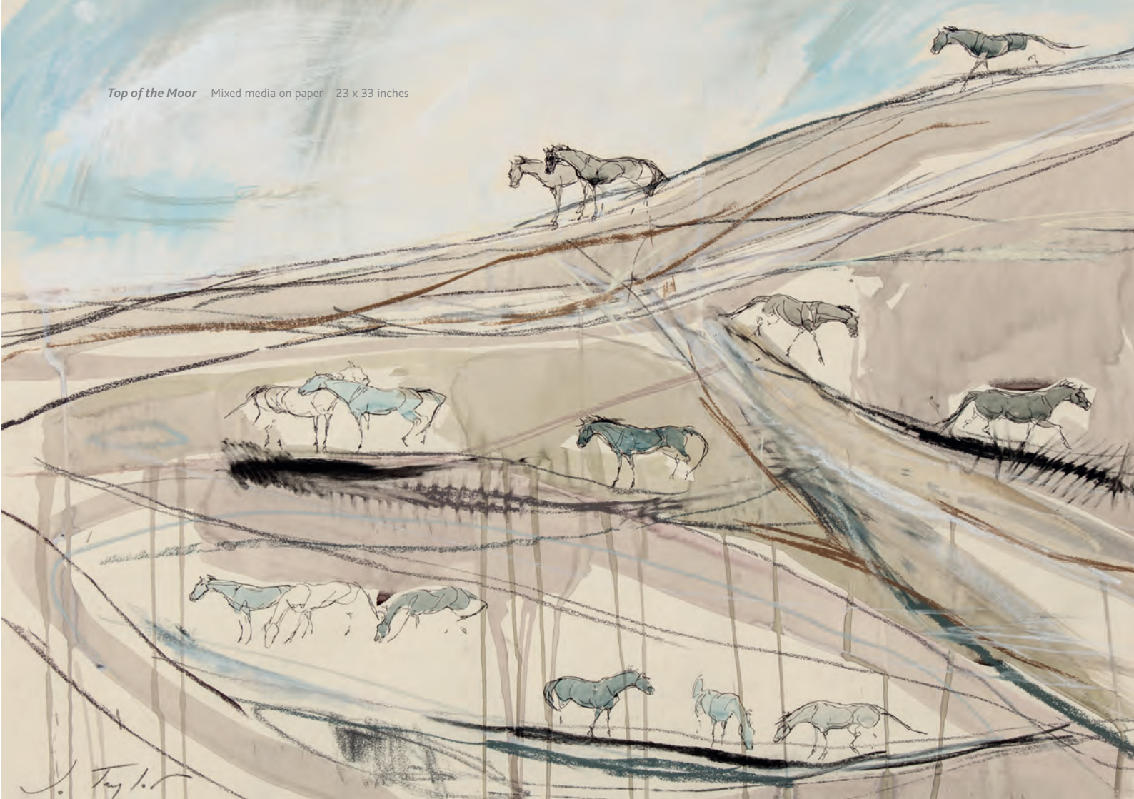
Top of the Moor Mixed media on paper 23 x 33 inches