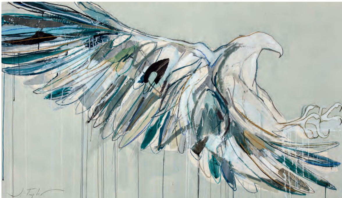
Raptor Mixed media on paper 34 x 59 inches