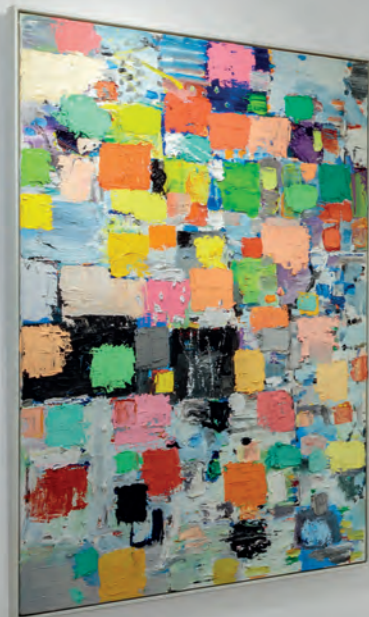
Contrast Render Oil on canvas 60 x 40 inches