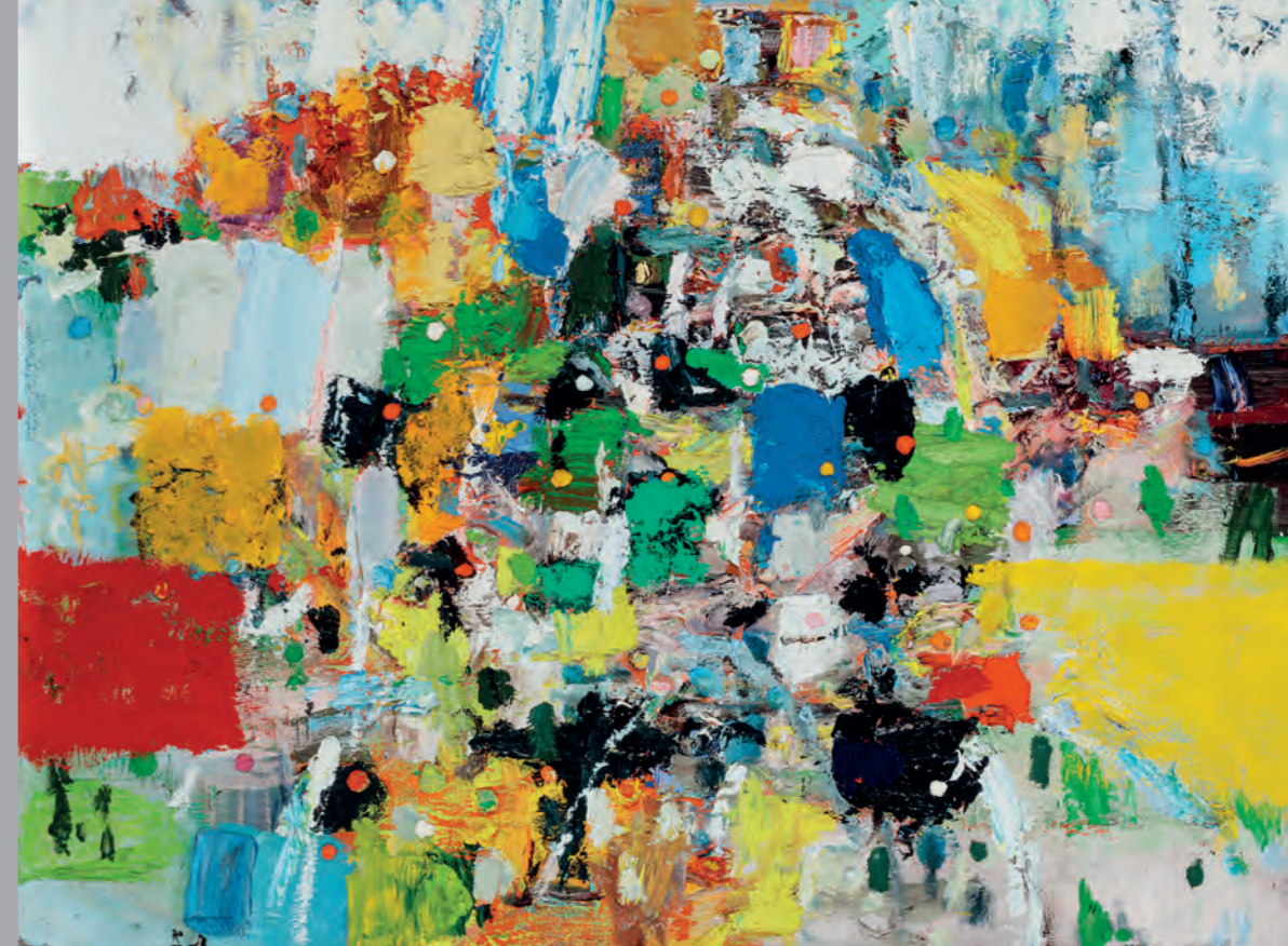
The Mine at Beaufort Oil on canvas 36 x 48 inches