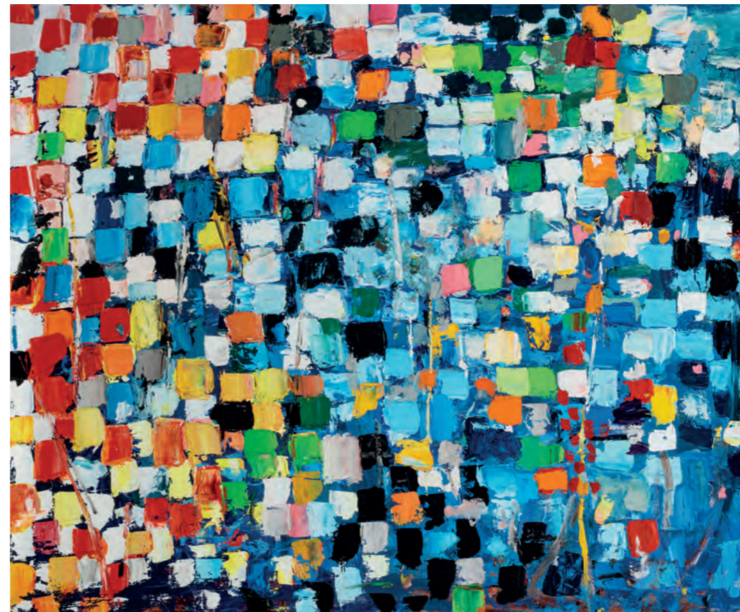
Constant Chrome Oil on canvas 46 x 56 inches