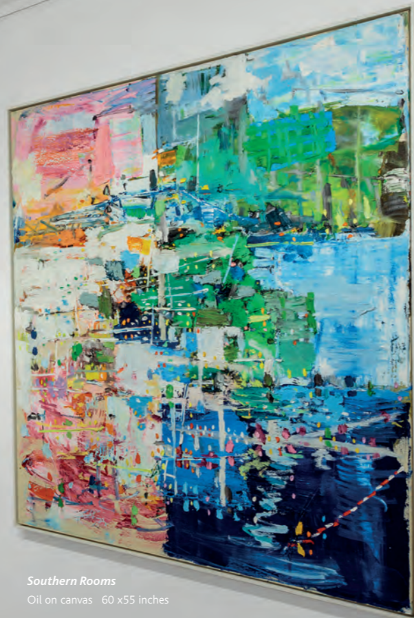
Southern Rooms Oil on canvas 60 x 55 inches