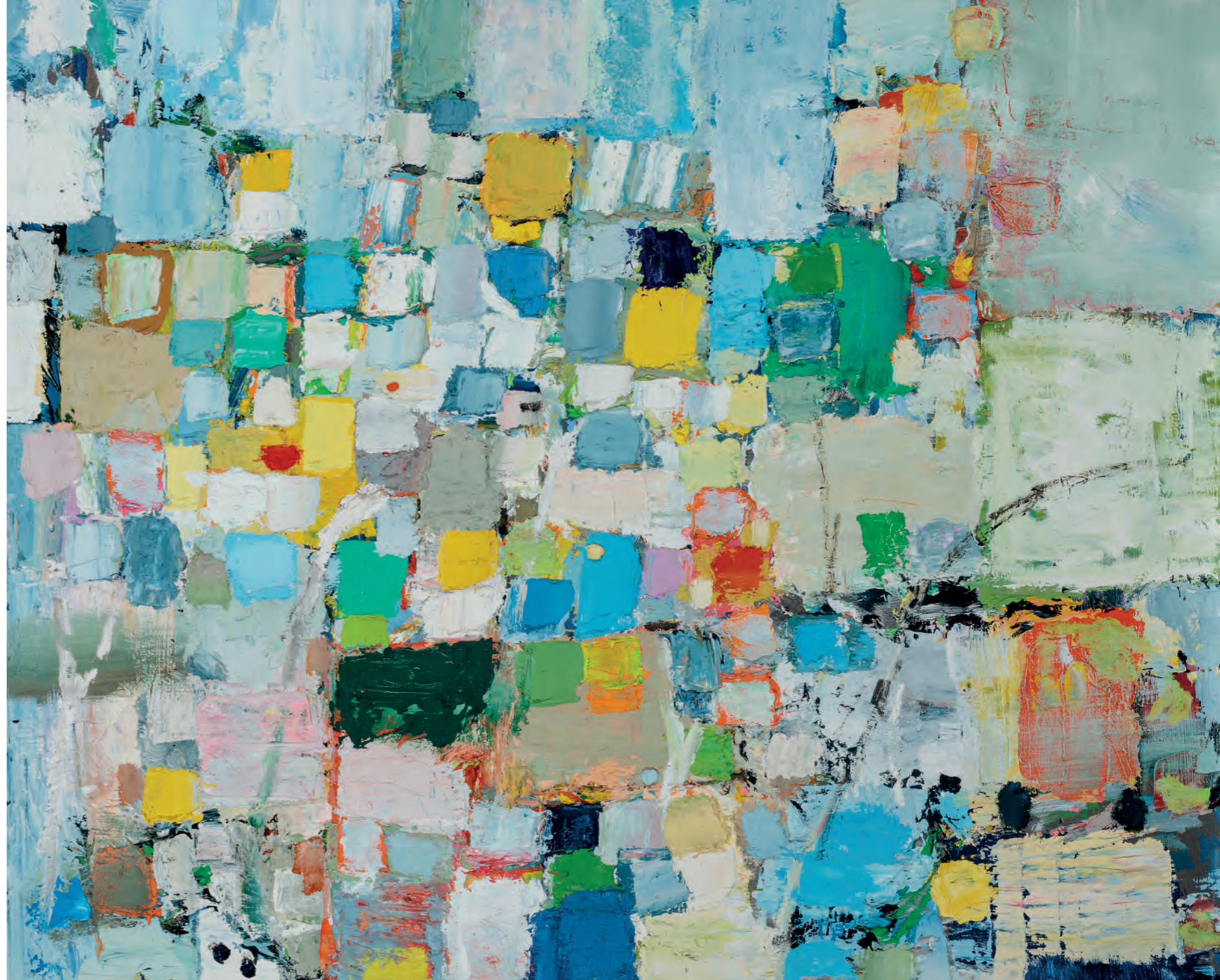
Celestial Coronation Oil on canvas 48 x 60 inches (right)