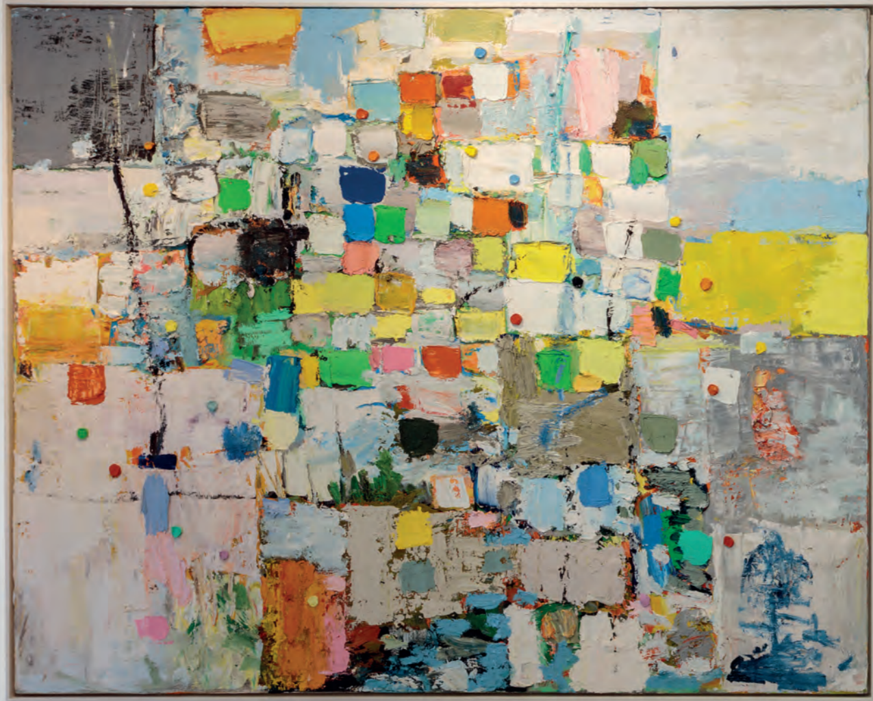
Light Geometry Oil on canvas 48 x 60 inches