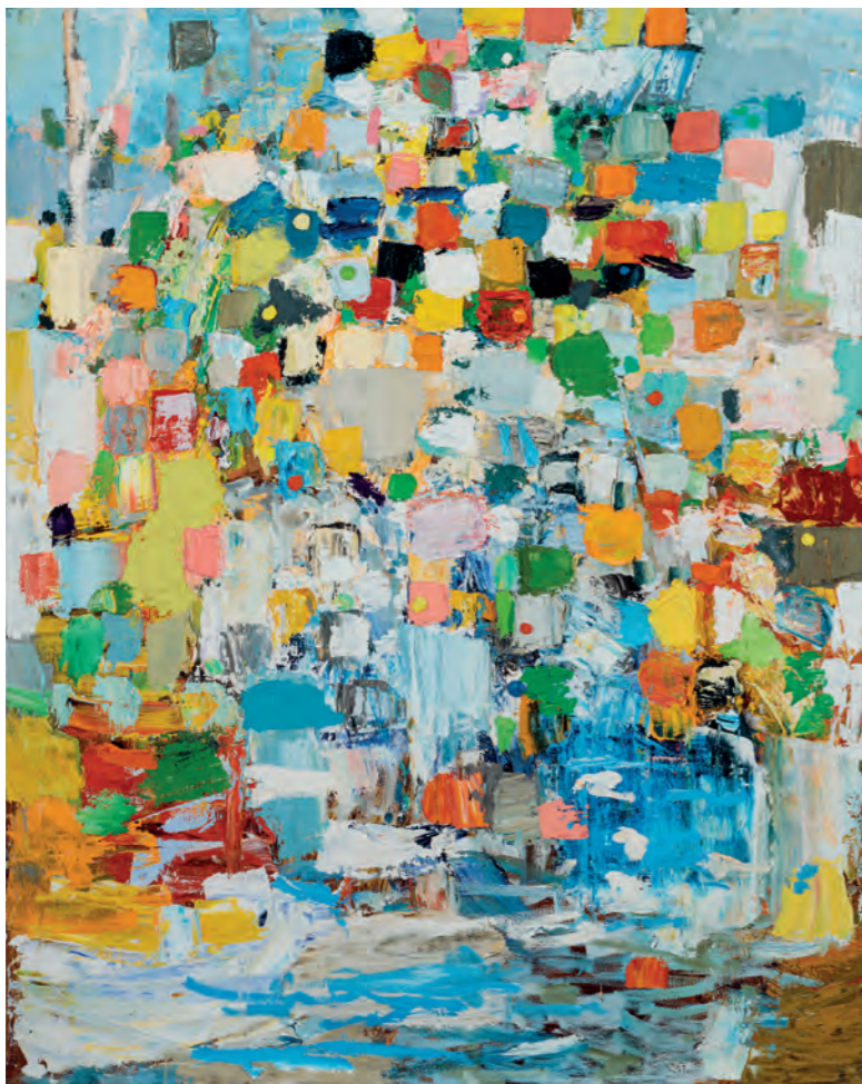
Primer of Colours Oil on canvas 60 x 48 inches