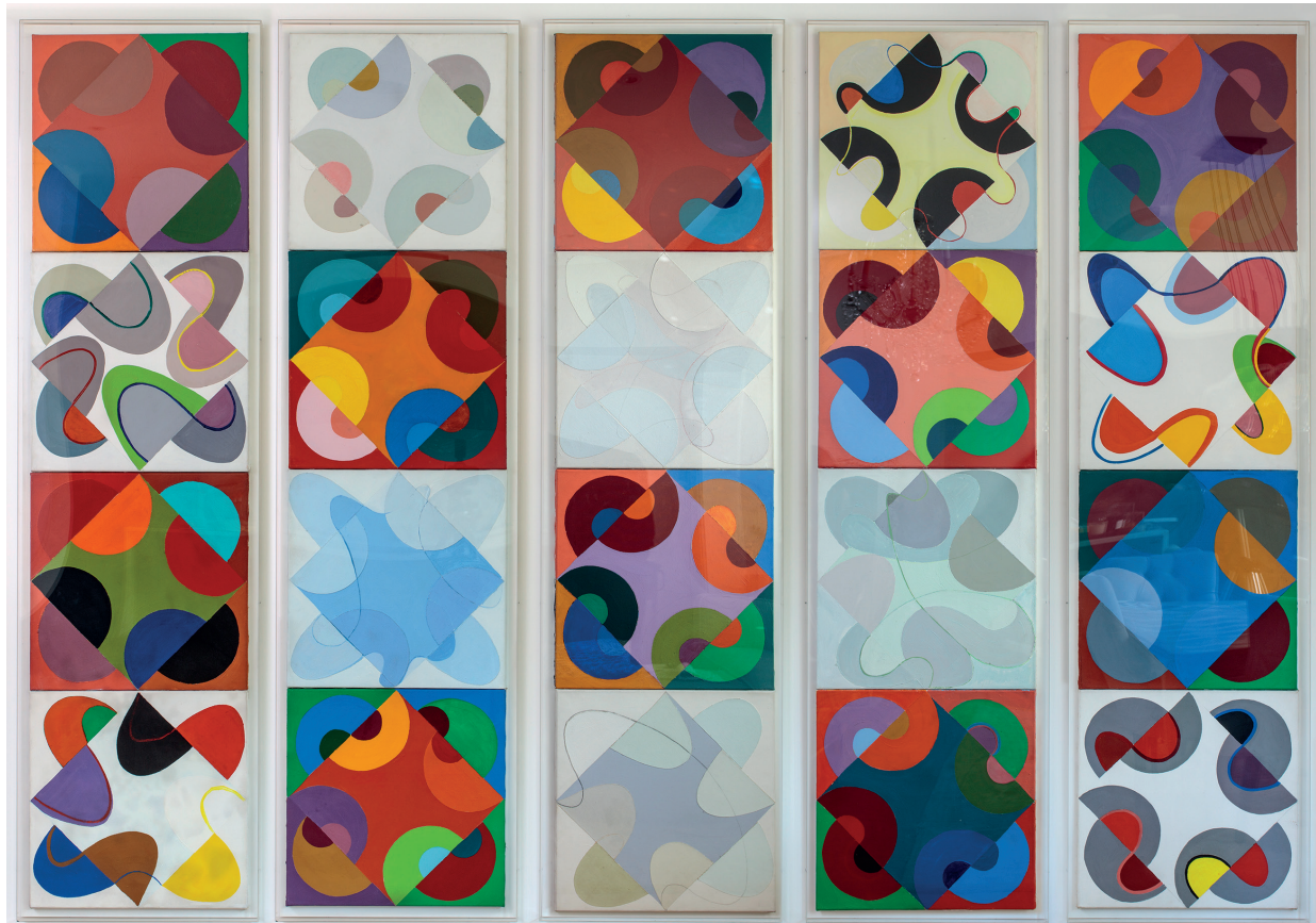
Newlyn Rhythms 1981-88

Acrylic and collage on 20 canvases 88 x 110 inches / 223.5 x 279.5cm Framed in a Perspex box in 5 columns.