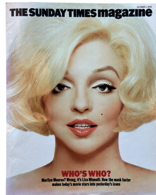
The Sunday Times Magazine – October 1st 2000