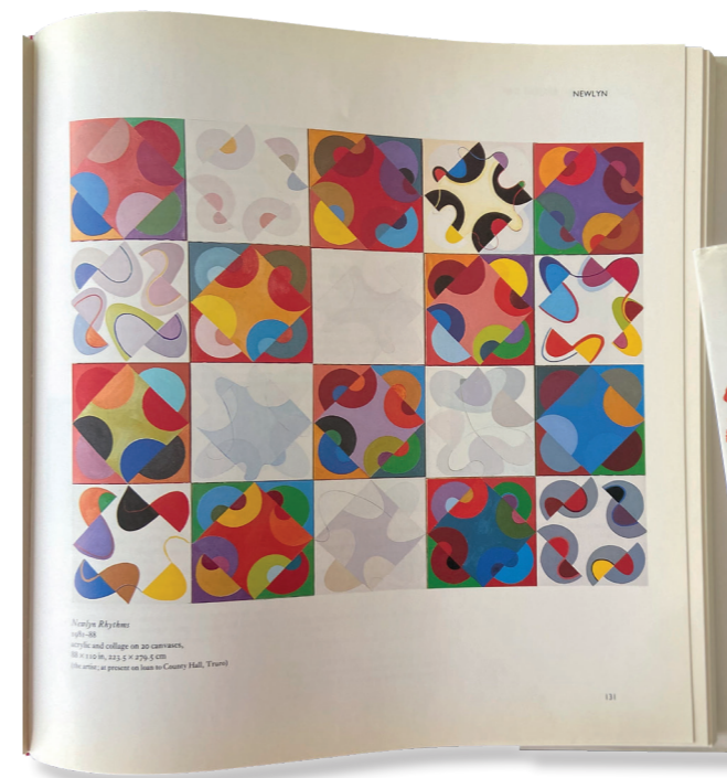
Terry Frost by Adrian Heath page 131